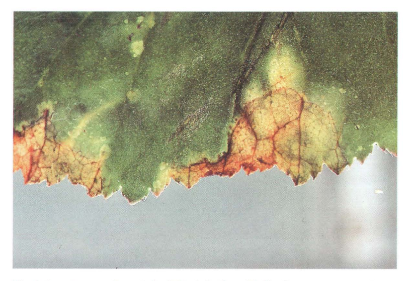
Fig. 1. Symptoms on Begonia -leaf after infection with Xanthomonas campestris pv. begoniae .

Begonieblad smittet med Xanthomonas campestris pv. begoniae.