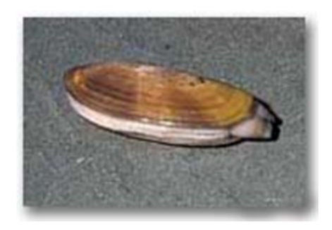
Figure 20. Razor clams showing inability for shell to close completely