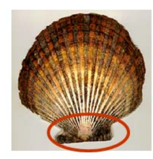
Figure 5. Weathervane scallop has equal auricles circled in red.