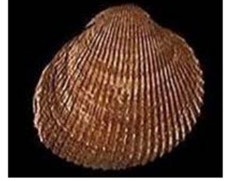
Figure 13. Hairy cockle has hairlike structures along the top of the ribs