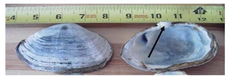
Figure 17. Softshell clam with chondrophore on a single shell