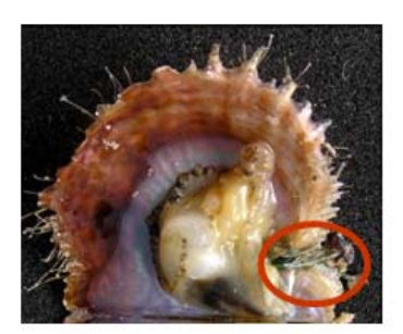
Figure 4. Red circle shows byssal threads used as temporary attached