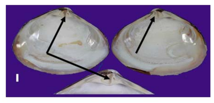
Figure 16. Chondrophores on both shells of an Arctic surf clam and close-up view in bottom photo