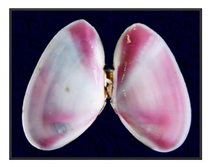
Figure 24. Note the striking color of the shell of the Alaska great tellin clam.