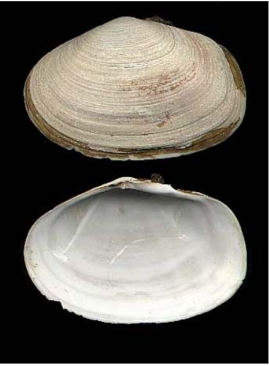
Figure 25. California sunset clam. Not the pinkish ting on the exterior of the shell when the white shell surface is exposed.