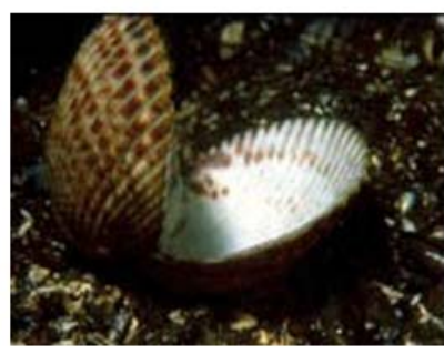
Figure 10. Uniform shape of a cockle