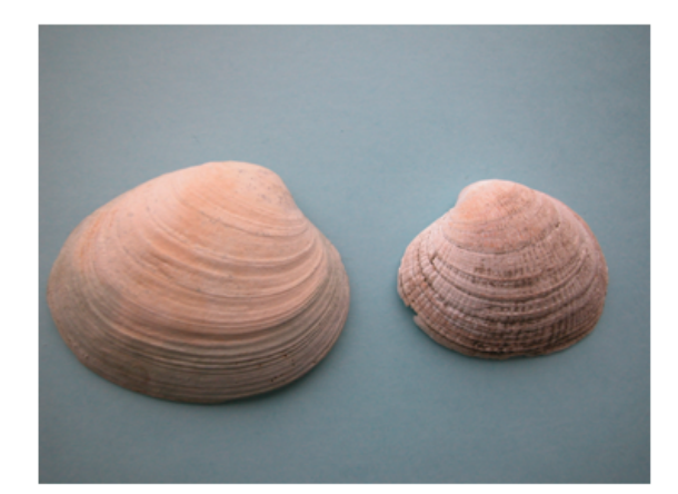
only concentric rings on shell