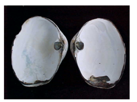
Figure 18b. Fat gaper note the hinge is offset toward on end of the shell.