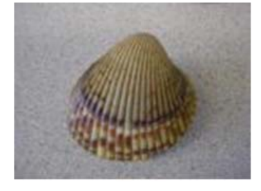
Figure 14. Nuttallii cockle, close examination with reveal crescent shaped nodules on top of ridges