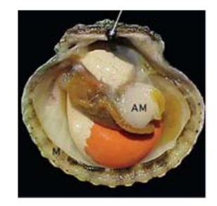
Figure 2. Scallop and oysters have a single muscle