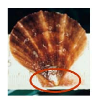
Figure 6. Unequal auricles circled of the spiny scallop spines on radial ridges