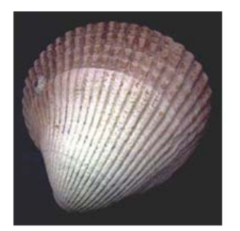
Figure 15. California cockle with no nodules or hairlike structures on ribs