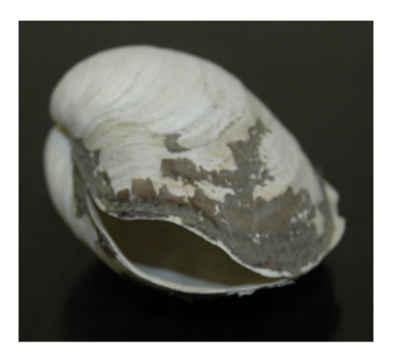
Figure 18a. Fat gaper with posterior gap in the shell.