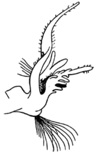
FIG. 4.—Podobranchia of Eiconaxius acutifrons .

A podobranchial plume in a rudimentary condition is attached to the base of all the mastigobranchiæ, except that of the first gnathopoda and the penultimate pereiopoda; on those belonging to the second and third pairs of pereiopoda there are a few branchial filaments attached to the base of the stem, but fewer in the third than in the second, and these gradually diminish in importance towards the distal extremity, where they exist only in the form of papilliform protuberances some distance within the extremity, which is sparsely fringed with small hooks, as shown in the annexed woodcut.