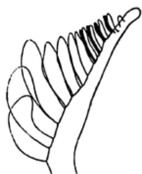
FIG. 2.—Arthrobranchia of Cheramus occidentalis .

In the second pair of pereiopoda the arthrobranchial plume approximates more nearly to the form which exists in Callianassa , that is, of two longitudinal rows of long and slender plates compressed closely against one another; but as these plates approach the extremity of the plume, they lose the flattened or compressed condition, and have a more cylindrical appearance.