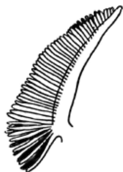
FIG. 3.—Arthrobranchia of Scyllaris amboinensis .

The pleopoda are biramose, attached to a short peduncle; the outer and larger branch springs from the side of the peduncle, the other from the apex. The outer branch is crescent-shaped, and almost encloses the inner. It is fringed on the outer or convex margin with numerous long hairs of a peculiar structure. Every hair articulates at the