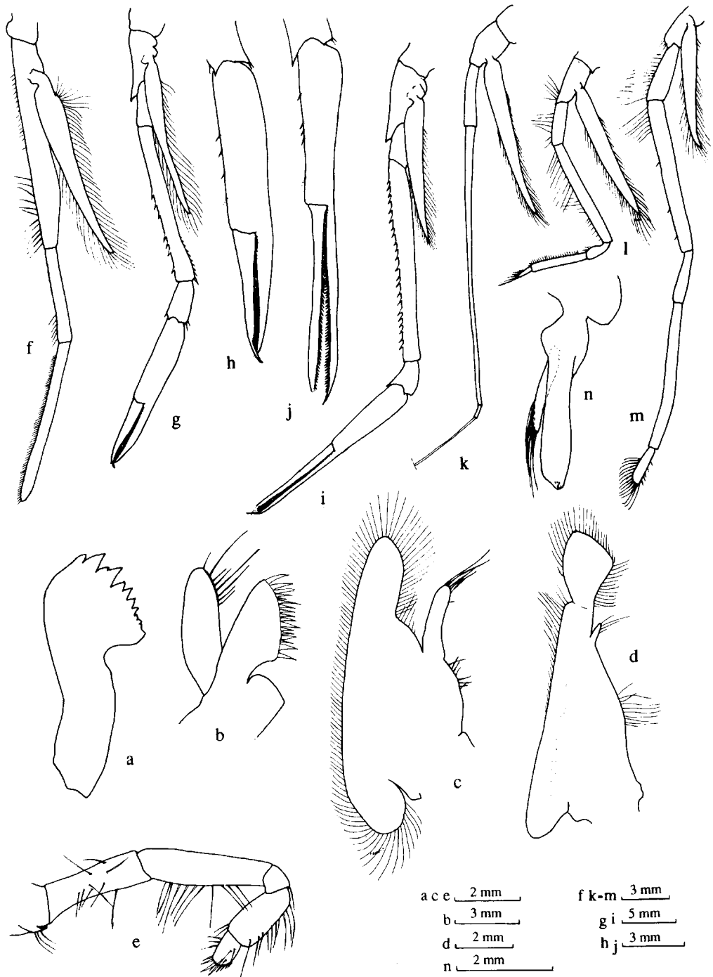
Fig. 2. Pasiphaea levicarinata sp. nov. a-m, paratype ovig. female, cl 31.8 mm, n, paratype, male, cl 36.0 mm. a, mandible; b, 1st maxilla; c, 2nd maxilla; d, 1st maxilliped; e, 2nd maxilliped; f, 3rd maxilliped; g, 1st pereopod; h, same, distal portion; i, 2nd pereopod; j, same, distal portion; k, 3rd pereopod; l, 4th pereopod; m, 5th pereopod; n, appendix masculina and appendix interna.