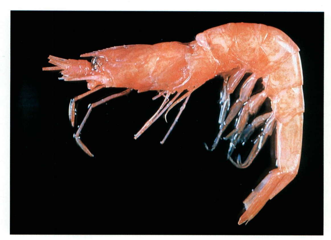
Fig. 2. Nematocarcinus undulatipes Bate, 1888, male 15.9 mm cl., specimen damaged and with pereiopods mostly lost.

Nematocarcinus undulatipes Bate, 1888: 801, pl. 130 [type-locality: the Philippines, Indonesia and Kermadec Islands]; de Man, 1920: 83, pl. 8-fig. 20-20h; Chace, 1986: 76, figs. 41-42; Hayashi, 1986: 90; fig. 51; 1988: 445, fig. 156f, 157a-b.