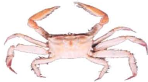
Macrophthalmus (Ventius) latreillei (Desmarest, 1822).

Description: The carapace (Fig. 1A) is much broader than long it is 2.1 cm, long including rostrum and 3.1 cm broad. Tesch (1915: 183) stated that in this species the shape of the carapace vary considerably in some cases being nearly equilateral, in others much more elongated transversely. The dorsal surface is provided with fine granules and fine setae all over, the regions are well defined with grooves, the granules are in definite pattern and pose bilateral symmetry. The lateral margins are parallel and converge posteriorly. These margins are fringed with thick long plumose