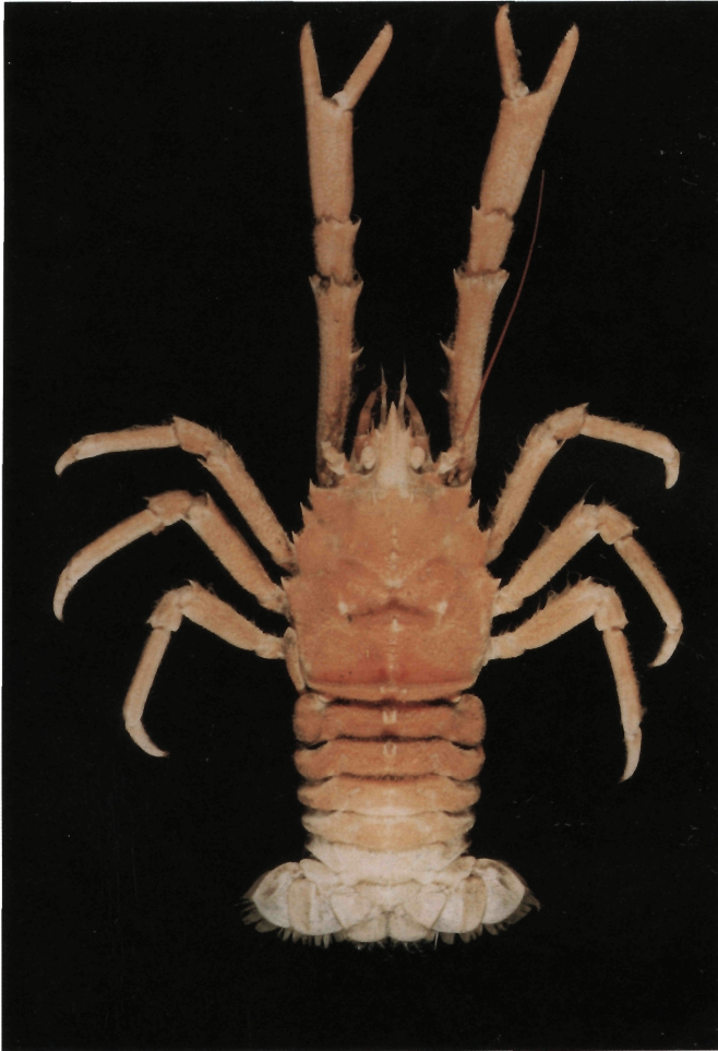
Fig. 3. Munidopsis formosa , new species, ovigerous ♀ paratype cl 22.5 mm, N. E. Taiwan (NTOU-P 1998-05-15).

more small spine present between the large submedian spines) with the lateral parts always devoid of spines (Fig. 1a). Moreover, the rostrum is distinctly narrower (near 4 times as long as wide) and with the tip abruptly curving upward in the Japanese material (Fig. 2b). The rostrum in the Taiwanese form, however, is rather broad (2.5 times as long as wide) and only gently bending upward at tip (Fig. 2a). The coloration of the Japanese material also appears to be more reddish. Color photographs of a live specimen collected off Boso Peninsula (180–250 m) showed that the body color of the Japanese material is