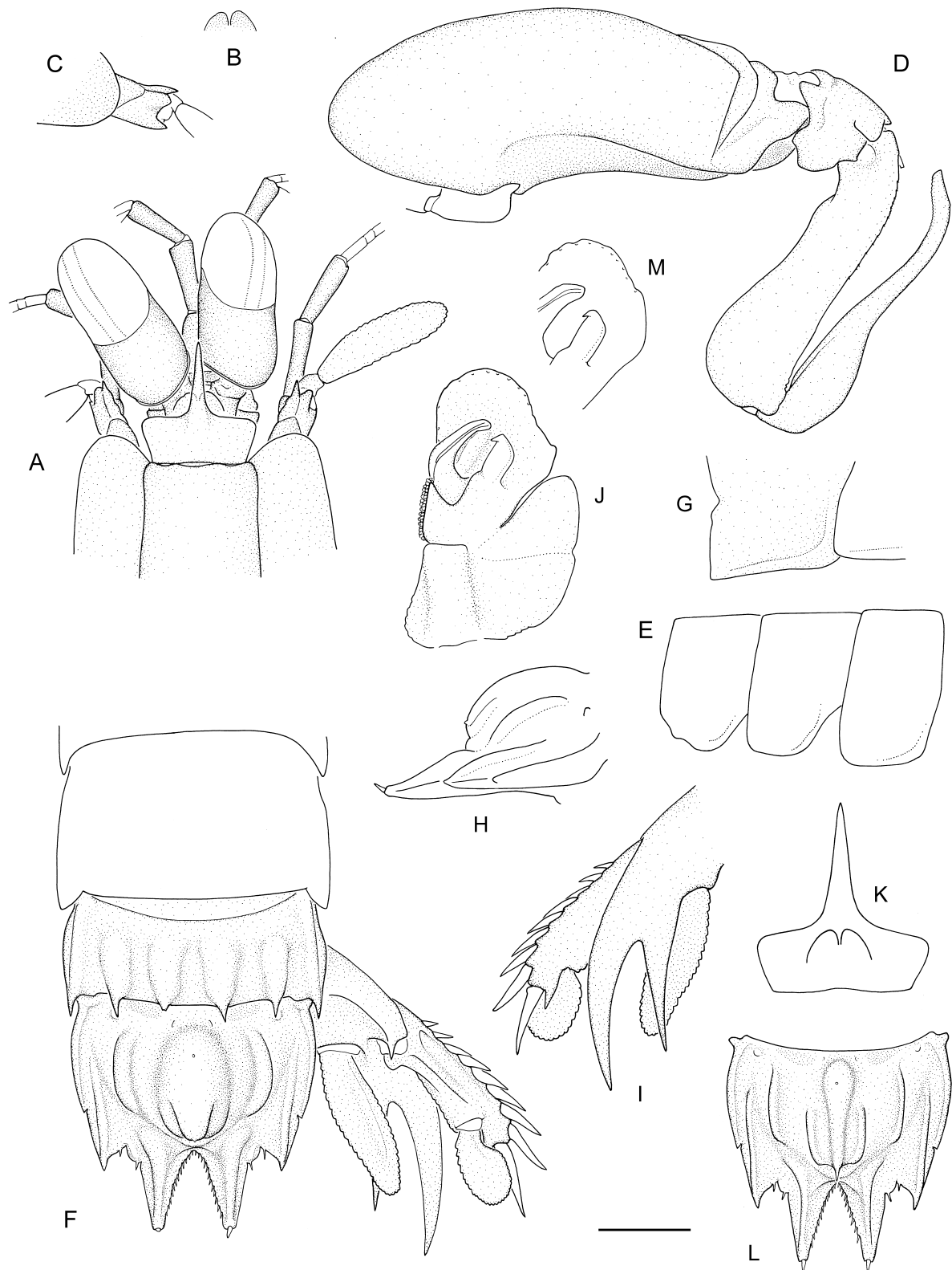
FIGURE 3. Gonodactylellus kume sp. nov. A–J, male holotype, TL 22 mm (RUMF-ZC-01262). K, male paratype, TL 14 mm (ZRC 2011.0824). L, female paratype, TL 21 mm (AM P87564). M, male paratype, TL 21 mm (AM P87564). A, anterior cephalothorax. B, ocular scales. C, right antennal protopod. D, right raptorial claw. E, thoracic somites 6–8, right lateral view. F, posterior abdominal somites, telson and right uropod. G, abdominal somites 4–5, right posterolateral angles. H, telson, right lateral view. I, right uropod, ventral view. J, right pleopod 1 endopod, anterior view. K, outline of rostral plate and ocular scales. L, telson. M, distolateral margin of right pleopod 1 endopod, anterior view. Scale A–I, L = 1.0 mm; J–K, M = 0.5 mm.