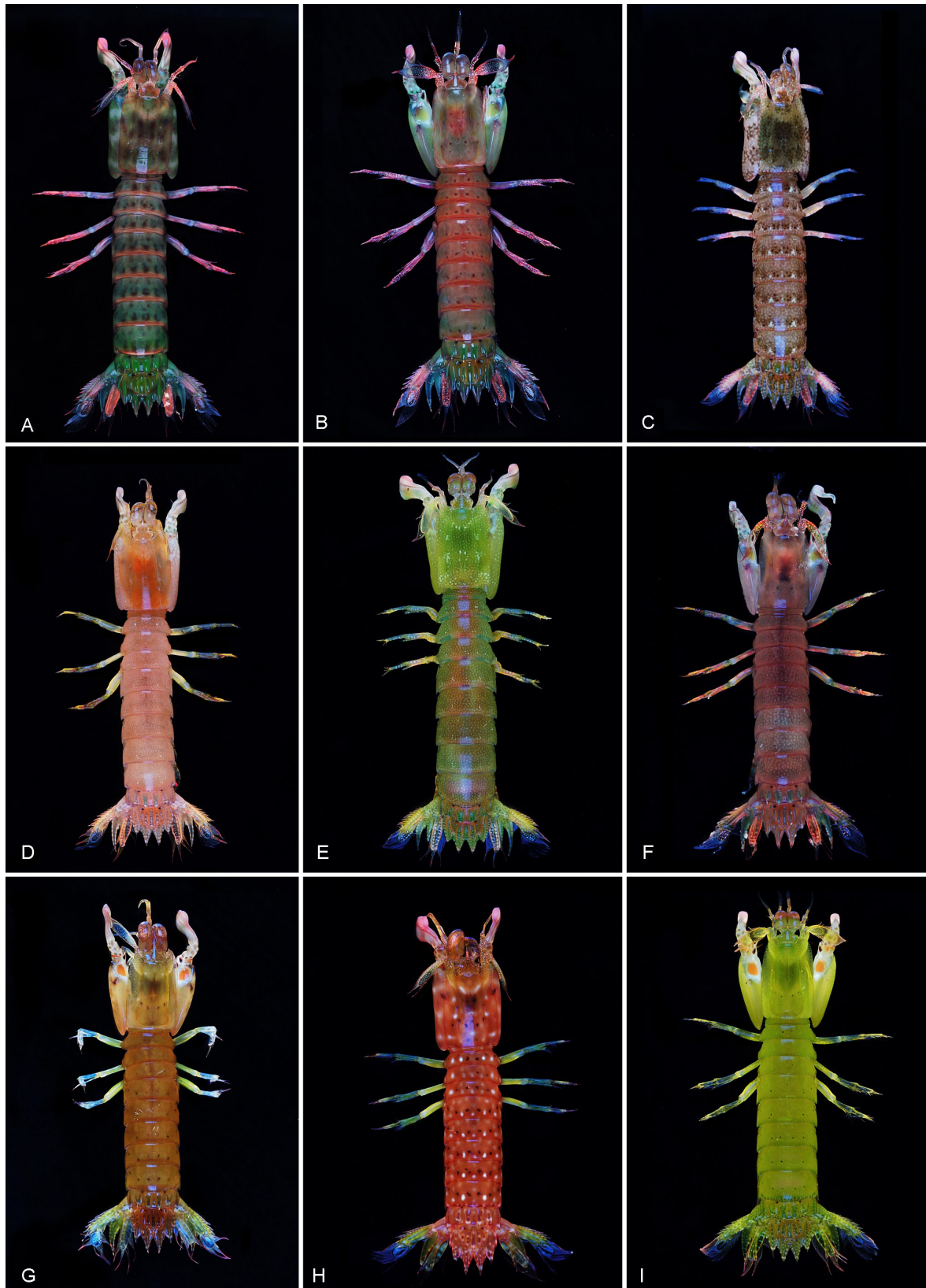
FIGURE 1. Colour variation in Gonodactylaceus . Gonodactylaceus falcatus (Forskål, 1775): A, male TL 41 mm (RUMF-ZC-01246); B, male TL 33 mm (RUMF-ZC-01241); C, male TL 33 mm (AM P87561); D, female TL 37 mm (RUMF-ZC-01246); E, female TL 42 mm (RUMF-ZC-01246); F, female TL 26 mm (RUMF-ZC-01246). Gonodactylaceus glabrous (Brooks, 1886): G, male TL 25 mm (RUMF-ZC-01249); H, female TL 28 mm (RUMF-ZC-01250); I, female TL 40 mm (RUMF-ZC-01253).