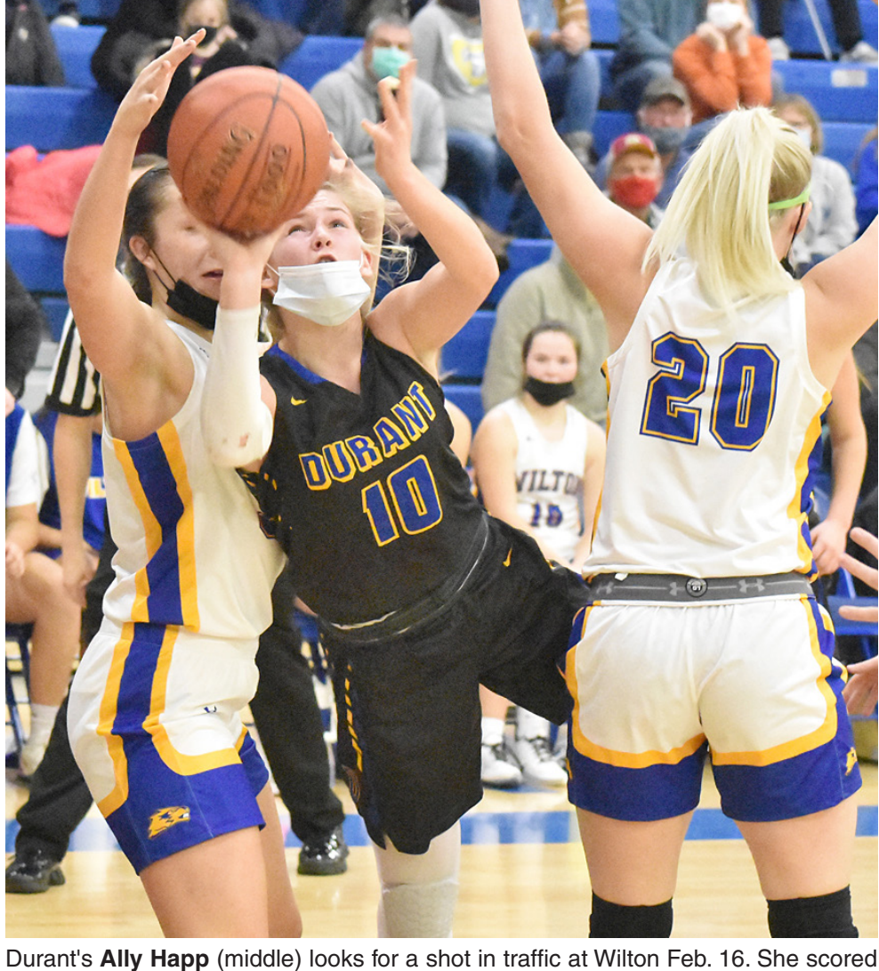
17 points and had 12 rebounds to lead Durant in a 47-43 loss to the Beavers.

Bellevue was better in the rematch, using a strong first half to distance itself from Wilton in a 56-41 win that pushed the Comets' record