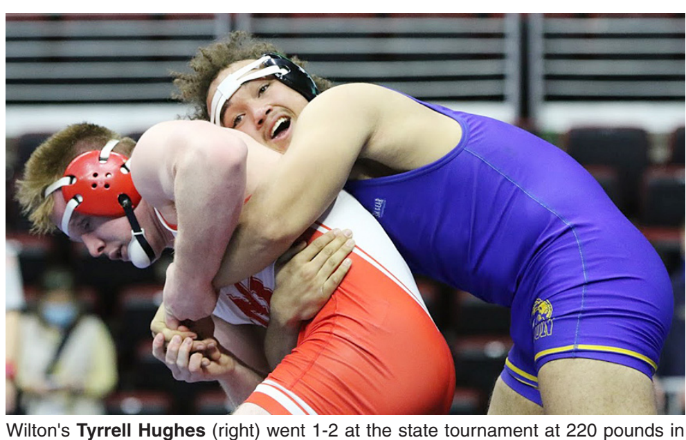
Class 1A, finishing a win away from the podium.