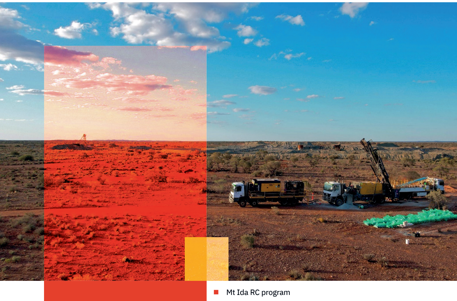
■ Mt Ida RC program