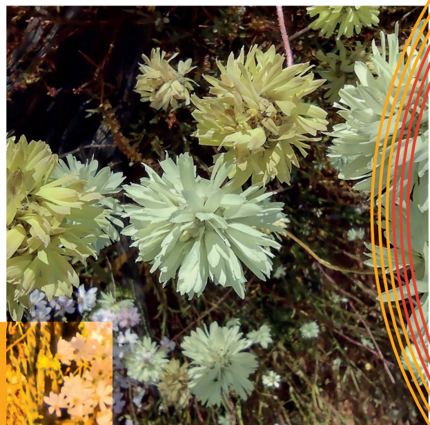
■ Reids Ridge Flora - Common name Pompom Head ( Cephalipterum drummondii )

Red Dirt Metals currently manage air quality onsite using dust minimisation techniques and systems such as the use of water sprays on drill rigs to reduce dust generation. It is our intention to capture air emissions data for future operational activities where relevant.