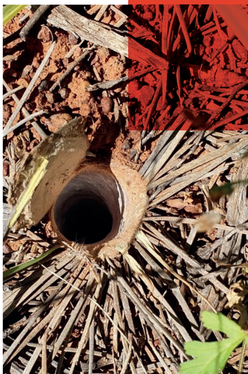
■ Idiosoma sp. Trapdoor Spider closed and open-door lids