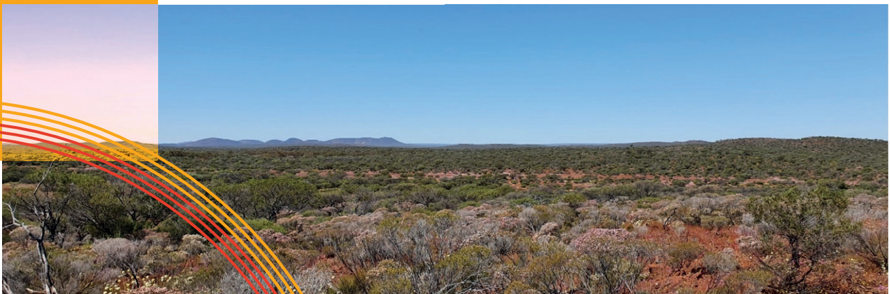
■ Reids Ridge Project

As the business develops, our systems will grow to reflect our commitment to develop a modern mine that delivers positive economic and social impacts. In a highly competitive industry we acknowledge that our demonstration of ESG credentials and commitments will influence our attraction as the employer of choice. We will look to continuously improve, measure and report in subsequent editions of this report.