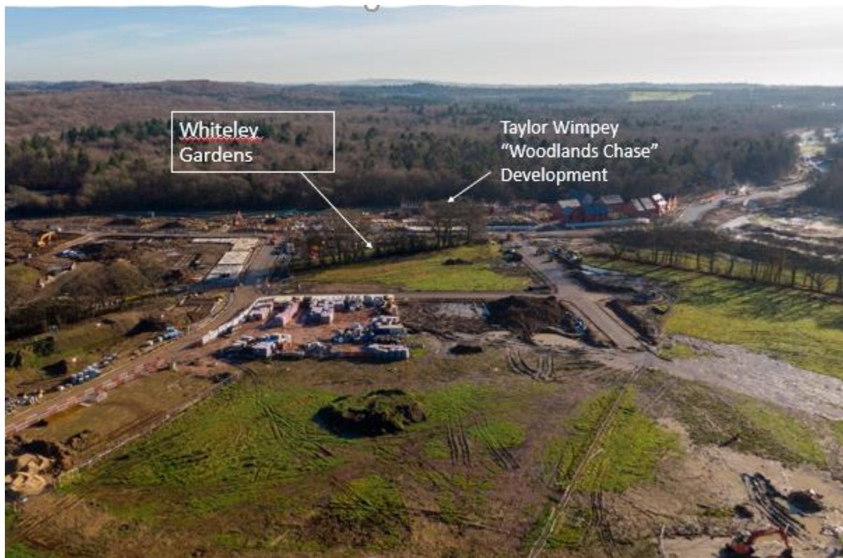
Plate 11: Whiteley Way South @ 21 Jan 2021