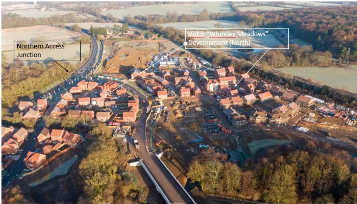
Plate 7: Northern Access Junction & Vistry North @ 21 Jan 2021

The main works to complete the junction are complete.