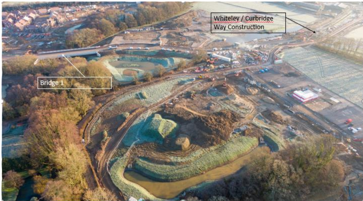
Plate 8: Bridge 1 & Whiteley / Curbridge Way Progress @ 21 Jan 2021

Works have commenced and are making good progress. The construction of these roads will form a link between Whiteley Way and Botley Road due to be completed by the end of 2021.