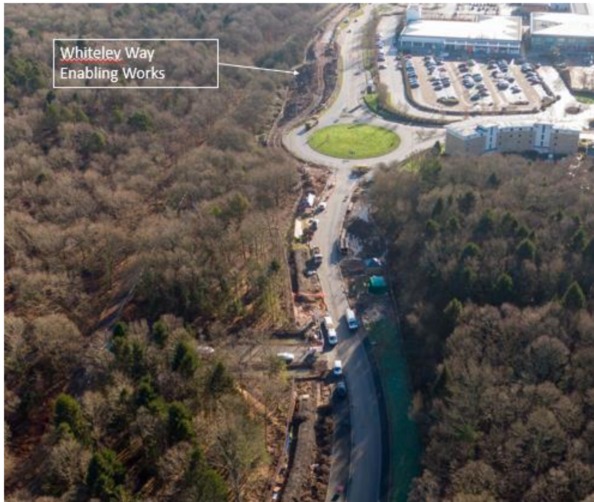
PLATE 12: View of Embankment Works from R3 looking South @ 21 Jan 2021

The contract for these advance off highway embankment works commenced in October and will continue until the end of February 2021. Associated utility ducting works will continue until the end of March.