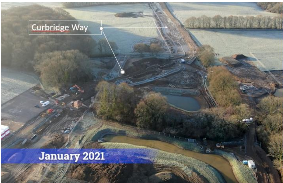
Plate 9: Curbridge Way Progress (view South) @ 21 Jan 2021