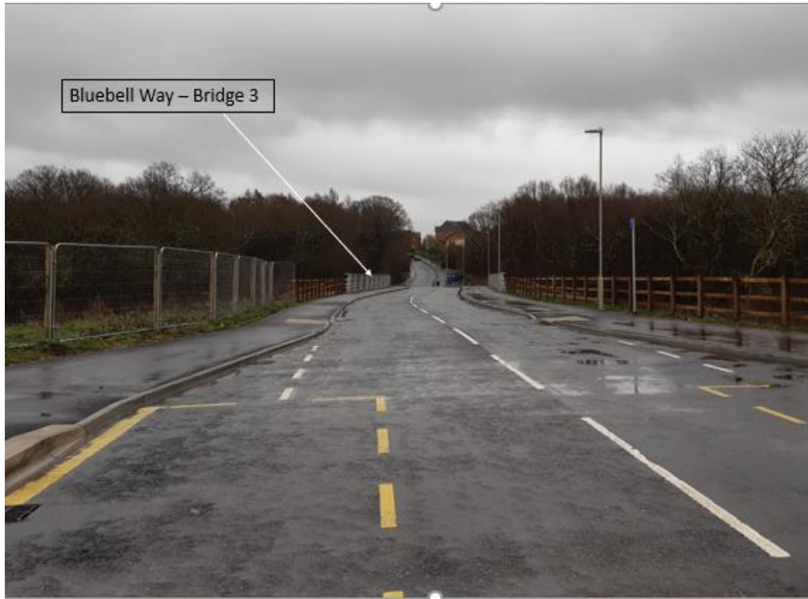
Plate 5: Bluebell Way Open – view South @ 16 Feb 2021.