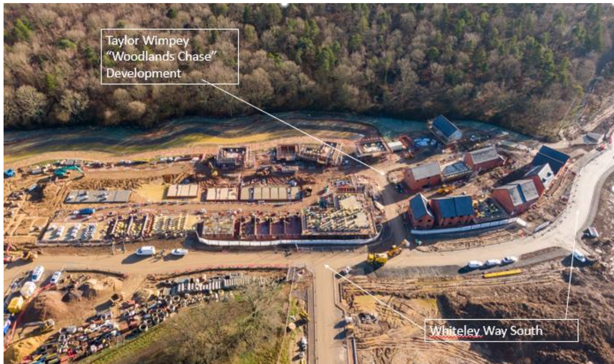
Plate 10: Whiteley Way South @ 21 Jan 2021

Works continue on the construction of the first stage of the Whiteley Way extension into the site from Roundabout R3.