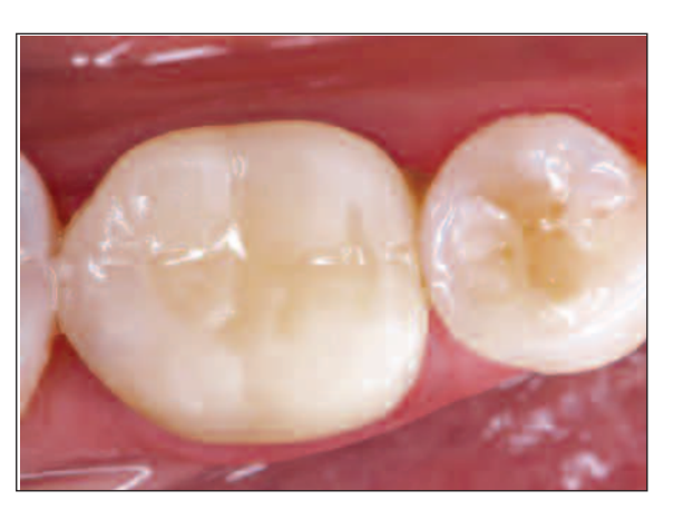
Figure 7. Fabricate provisional, finish, and rinse separating medium off prep with water, then cement provisional.