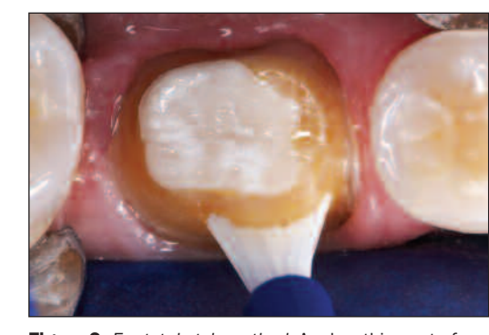
Figure 2. For total-etch method: Apply a thin coat of adhesive bonding resin (ALL-BOND 3, Part A and B, BISCO), air thin, then light cure for 10 seconds. Block out any undercuts using flowable composite. Apply a thin coat of bonding resin (ALL-BOND 3; OptiBond FL, Kerr), air thin, then light cure Or for self-etch method : Apply SE liner (All-SE, BISCO; OptiBond All-In-One, Kerr), air thin, and light-cure. Block out any undercuts using flowable composite.