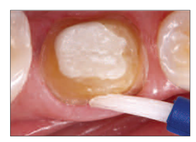
Figure 6. Apply separating medium (Pro-V Coat, BISCO) to entire prep, except 1 mm from cavo-surface margin to ensure retention. Gently air dry for 10 to 15 seconds to evaporate solvent.