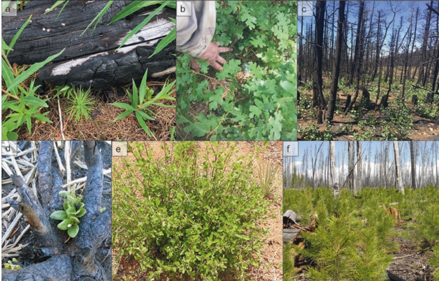
Fig. 8.2 Examples of different mechanisms that allow plants to recover following fire. Many conifer species such as (a) western larch and (b) Douglas-fir (small seedling beneath Gambel oak) regenerate from seeds dispersed into the burned area, which can make them less competitive than resprouting species in the first few years following fire. Many species are top-killed and resprout following fire, including (b) Gambel oak, (c) aspen, (d) russet buffaloberry, and (e) alderleaf mountain mahogany. Lodgepole pine (f) has serotinous cones that open with the heat of fire, often creating dense patches of regenerating trees.

cordifolia ), and silvery lupine ( Lupinus argenteus ) are common forbs that can regenerate following fire by sprouting (Lyon and Stickney 1976; Turner et al. 1997).