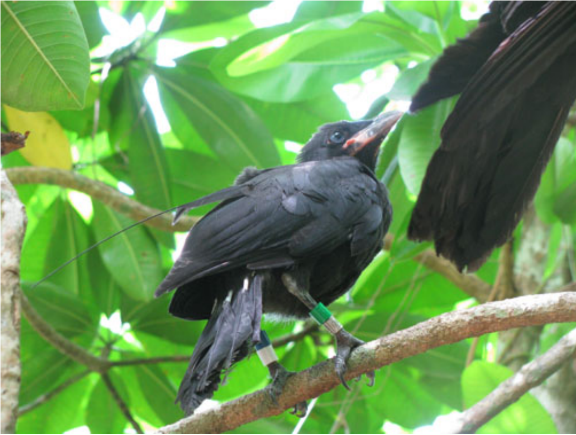
Radio-tagged crow: Day 2 out of the nest