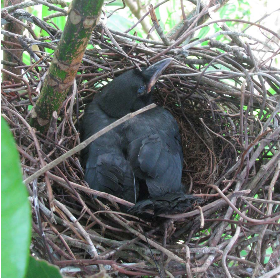
Above: Nestling crow with transmitter (note the antenna sticking out between the wings)