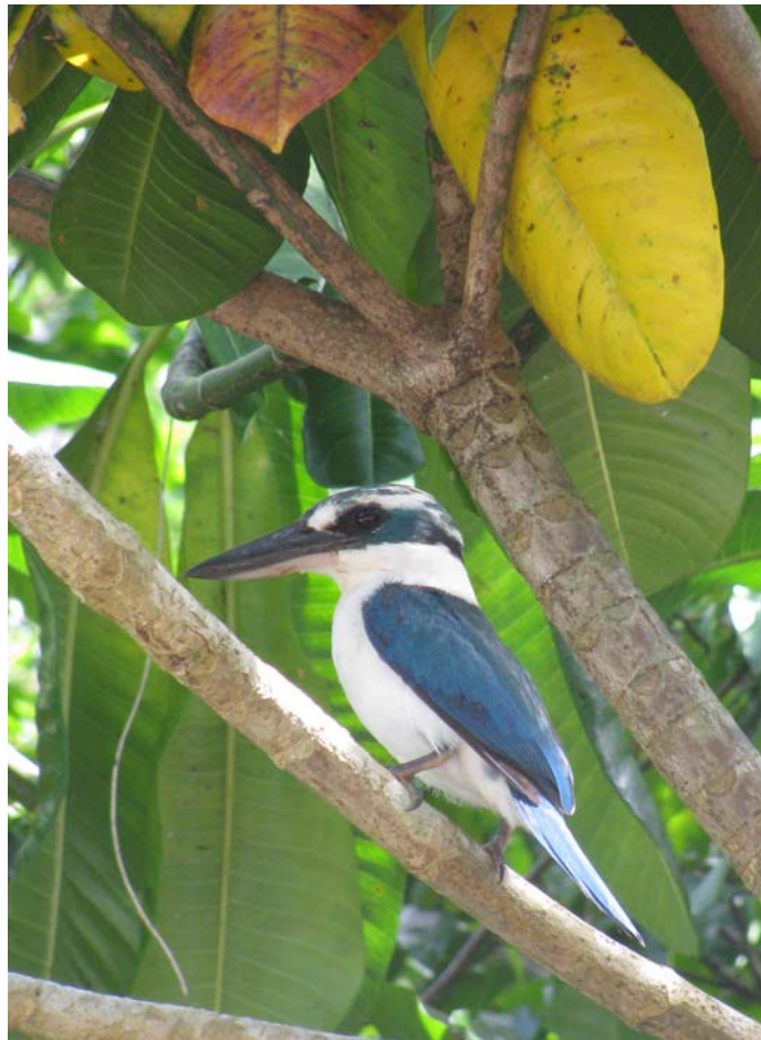
A kingfisher I photographed near the crow nest

A previous study on juvenile dispersal of Mariana Crows found a lengthy pre-dispersal period (during which family groups stay together) of 99-537 days. During this period color-banded fledglings were re-sighted at an average of 450 meters from their nest site and at a maximum of 850 meters. Our range on the transmitters is about 1.4 kilometers, if the transmitter is at least a few meters off the ground. So why couldn't we find our bird? One consideration is that the previous study was based only on re-sighting color-banded birds, with the resulting bias that if crows traveled outside the boundaries of the study area they would be excluded from future detections. It looks like our crow family is one that would have been "lost" from a study based on re-sighting color-banded birds. Since the adults are gone from this territory