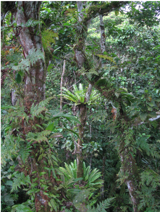
The forest at “Southern Cross”, a beautiful part of Rota BWEs cliffline forest habitat

grassland and the native limestone forests are limited to the cliff line.