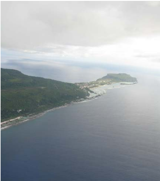
Above: From the air—the far southwestern end of Rota. The house I live in is circled.