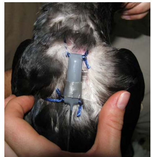
Transmitter on captive crow (looking down at the upper back)