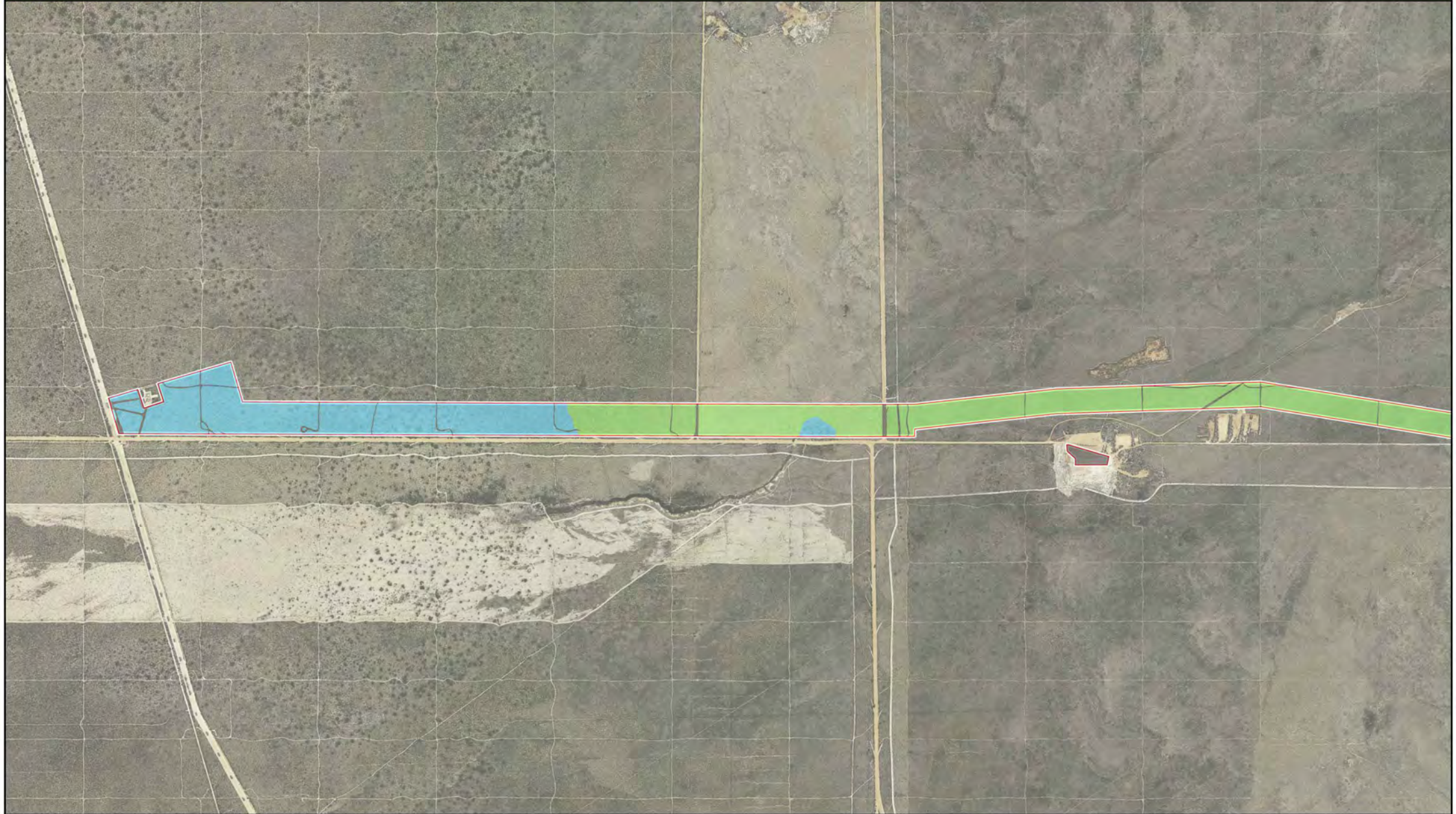
Figure 13: Carnaby's Cockatoo foraging habitat recorded in the survey area