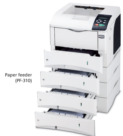
Paper feeder (PF-310)

Product depicted includes optional extras