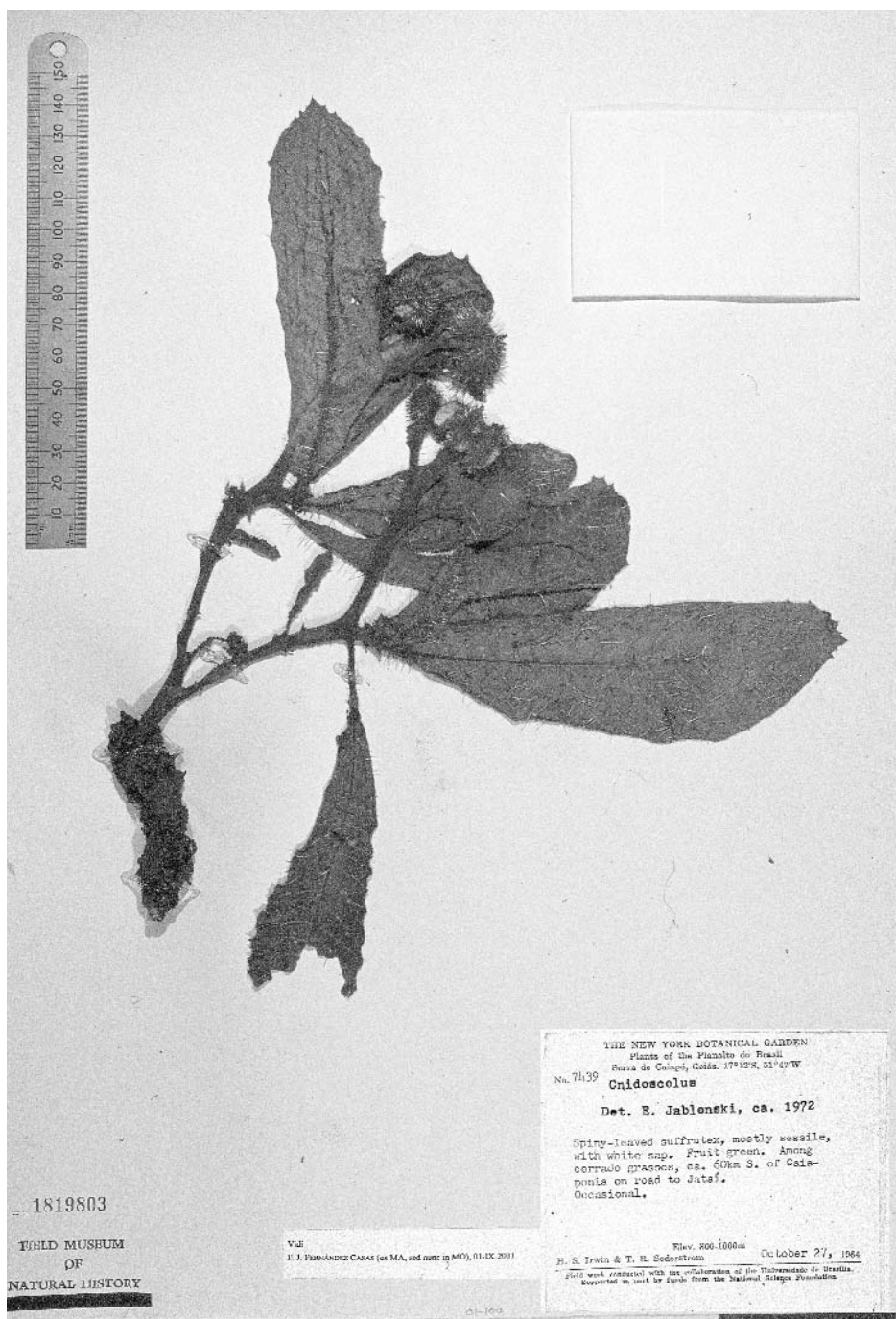
PLATE II Cnidoscolum spathulatus Fdez. Casas. H. S. Irwin 7439 (F 1819803, isotype).