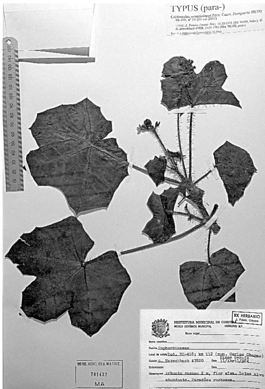
PLATE III Cnidoscolus urentissimus Fdez. Casas. G. G. Hatschbach 47820 (MA 701432, paratype).