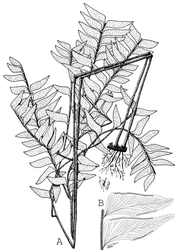
Figure 3. A-C. Lindsaea trapezoidalis (J. Pipoly et al. 14129, MEXU). A. General aspect of type specimen. B. Blade detail. Figura 3. A-C. Lindsaea trapezoidalis (J. Pipoly et al. 14129, MEXU). A. Aspecto general del espécimen tipo. B. Detalle de la lámina.

Comments. Kunze (1848) published it taxa as a varietal of Lindsaea pumila Klotzsch probably based in the small plants with 1-pinnate blade, but L. pumila has linear and narrower blade with small pinnae base, probably more related to L. cubensis Underw. & Maxon and L. parkeri (Hook.) Kuhn. Also the name L. pumila was used by Hooker (1867). After that, Kramer (1957) include this taxa as a varietal of L. lancea (L.) Bedd., but it is more related to L. leprieurii Hook. and L. falcata Dryand., two species with lanceolate and broader blades with an hastate with subconform apex. Also Kramer (1957) included as synonym of these taxa to L. pusilla Splitgerber, but this species is really