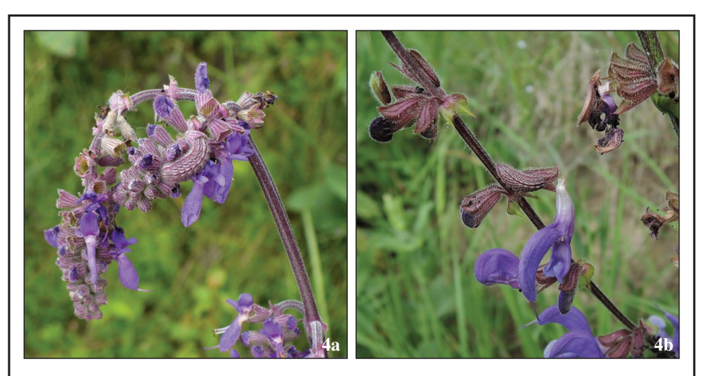
Figure 4. Larvae of P. bavius hungarica feeding on the inflorescence of Salvia nutans (a), and on the flower of S. transsilvanica (b).

followed by afforestation (e.g. Crişan et al. 2011, 2014). Both of these threats reduce the quality and size of P. bavius hungarica habitats. Populations are generally well protected in areas that have a steep gradient comprised of sage, which prevents them from being converted to arable land. P. bavius hungarica is also common in landscapes with steep slopes and clay-sandy soils because regular landslides create large areas of bare soil that are immediately colonised by Salvia spp. (including S. nutans ). In recent years it has been observed that S. nutans in these optimal habitats being replaced by invading S. nemorosa , a ruderal relative of S. nutans (Bădărău & Maloş, 2019) that is not able to support P. bavius hungarica populations.