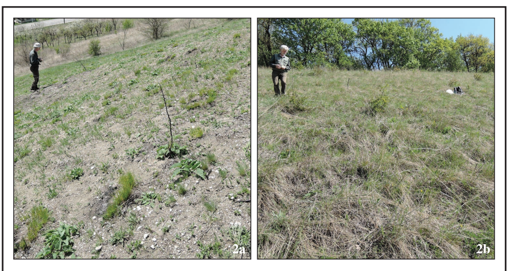
Figure 2. The difference between the vegetation structure from Suatu, set on fire in autumn / winter 2020 (a) compared to the one from Bărăi, unharmed, not set on fire (b).

The P. bavius hungarica population of Bărăi is much smaller than the population of Suatu, however, the abundance of the host plant is comparable in both areas. In Bărăi the vegetation is thicker meaning there is a lack of exposed topsoil that which can slow the plant's development, and cause an associated phenological delay in P. bavius hungarica (Jakab & Kapocsi, 2005) (Figure 2). Additionally, the high density vegetation in Bărăi hinders the growth of ant populations (specifically L. paralienus and C. aethiops ) which are involved in a commensal myrmecophilous relationship with P. bavius hungarica , whereby they provide protection to larvae and facilitate increased survival rates (Német et al. 2016).