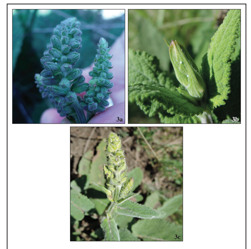
Figure 3. Eggs of P. bavius hungarica laid on the inflorescence of Salvia nutans (a), respectively on the flower bud of S. transsilvanica (b, c).

plant makes it possible to conceive of the existence of populations of P. bavius hungarica in areas without S. nutans , provided S. transsilvanica is present. Considering the many flowers that adults visit for feeding, P. bavius hungarica is also a successful pollinator. Similarly to other lycaenid species, P. bavius hungarica show no egg avoidance behavior (Árnyas et al. 2009; Dinesh & Venkatesha, 2013; Jansson, 2013; Van Dyck & Regniers, 2010) (Figure 3). The maximum number of eggs observed at Coasta Lunii on a single plant ( S. transsilvanica ) was 34.