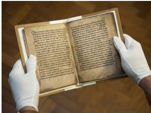
Llyfr Aneirin (The Book of Aneirin) , a Welsh manuscript written ca. 1250-1300

It has been the intention for some time that the Dictionary should go online, but it has been a long process as it was necessary to encode all the Dictionary data—around