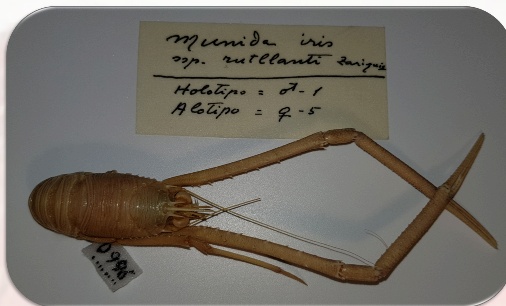
Fig.2 Munida iris rutllanti Zariquiey Álvarez, 1952