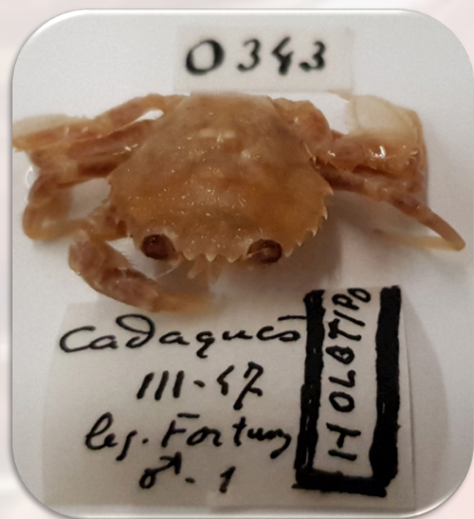
Fig.1 Portunus bolivari Zariquiey Álvarez, 1948

The Zariquiey decapod crustacean collection, located at the Institute of Marine Sciences of Barcelona (ICM-CSIC), is one of the most important repositories of this zoological group in the Mediterranean, and is masterfully reflected in the work "Crustáceos Decápodos Ibéricos" (Zariquiey Álvarez, 1968). The collection is currently composed of more than twenty thousand catalogued specimens, and is completely accessible through GBIF (Global Biodiversity Information Facility). One of its most important contents is the set of type specimens, composed of 12 species with a total of 490 type specimens, all of them belonging to the Mediterranean area. This work is presented with the objective of complying with the International Code of Zoological Nomenclature, which recommends that every Institution in which name-bearing types are deposited should publish lists of name-bearing types in its possession or custody. All information available on these specimens is provided; their original and current taxonomic status, with their respective published sources, and all information retrieved from the original tags that accompany the samples is presented in the collection, as well as all the references that examine the changes produced in the taxa. Some charismatic species described by Zariquiey Álvarez include Portunus bolivari Zariquiey Álvarez, 1948 (Fig.1), Munida iris rutllanti Zariquiey Álvarez, 1952 (Fig.2) and Brachynotus foresti Zariquiey Álvarez, 1968 (Fig. 3).