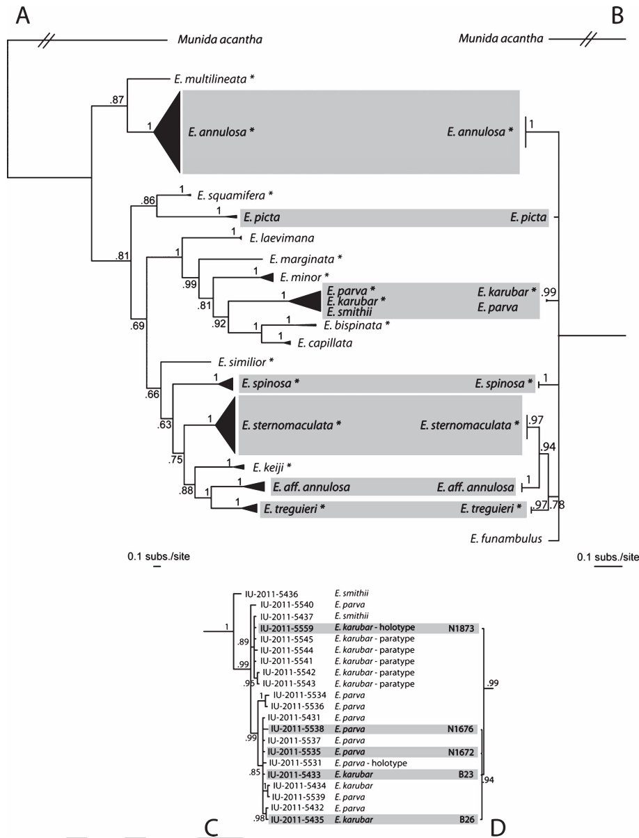
Fig. 2. (A) Bayesian tree for COI gene dataset, with posterior probabilities indicated for each node. Clades are collapsed in triangles, with the height representing the number of specimens and the width the length of the branches. An asterisk indicates units that include a type specimen. (B) Bayesian tree for the 28S gene dataset. (C) Detail of the COI gene tree for the E. parva / E. karubar / E. smithii clade. (D) Detail of the 28S gene tree for the E. parva / E. karubar / E. smithii clade.

0.033 with the COI gene. Conversely, when the genetic distance between two 28S rDNA sequences is greater than 0.018, the genetic distance between COI sequences corresponding to the same specimens is greater than 0.043. The intraspecific distances between type specimens fall in the short-distance group whereas interspecific distances between type specimens fall in the long-distance group. The 28S dataset reveals the same monophyletic lineages as the COI dataset: among the 16 lineages defined with the COI gene, seven correspond with clusters identified by the 28S gene (Fig. 2B). Furthermore, one additional lineage, not sequenced with the COI gene, is defined with the 28S gene. The