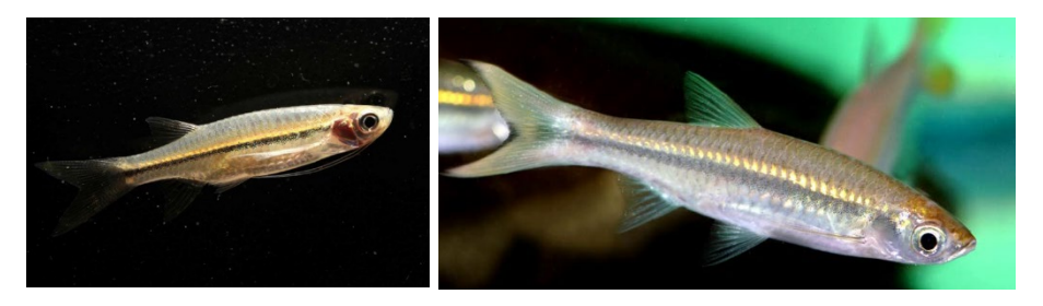
Photo: Left: Esomus longimanus; Right: Rasbora tornieri. Two main micronutrient-rich fish species found in Cambodian rice field

Beside the three local NGO partners, the Fisheries Administration (FiA) and Department of Aquaculture Development (DAD), WorldFish also partnered with the National Research and Aquaculture Development Institute (NARDI) to start research to identify local micronutrient-rich fish for future domestication. The research identified two species: Esomus longimanus , an abundant rice-field fish species rich in zinc and iron; and Rasbora tornieri , a small fish species with a high vitamin-A content. The research aimed to develop a method for the characterization of morphological traits, dietary requirements, reproductive cycles and growth rates, and the collection and transportation of the two species. This research is funded by the CGIAR Research Program (CRP) on Fish Agri-food Systems (FISH).