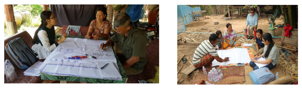
Photos: Left: Gender consultant and VSG staff has facilitated in testing of family vision and planning with farmer at Treos Village Ou Taky Commune Thmar Kol District; Right: Family visioning map in Okrakalanh village (Slem Reap)

In 2018, the remaining 36 households, and additional beneficiaries joining the project in 2018 will receive similar support for family visioning and planning. The results of the family visioning and planning will be compiled and analyzed in 2018, and provide a baseline to assess progress toward greater gender equity and women's empowerment.