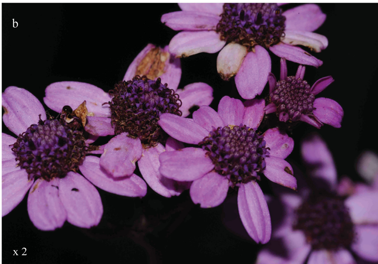
PLATE 1. Pericallis menezesii : a , habit (Pico Branco, R. Jardim, 16/05/2010); b , capitula (Pico Branco, Miguel Sequeira, 29/04/2013).