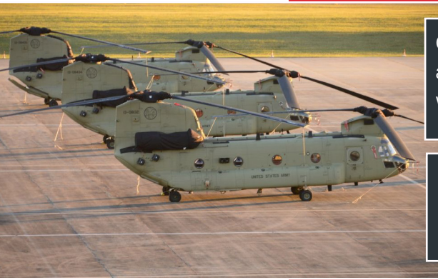
Crew Served M134D Minigun on a CH-47, system is compatible with CH-47 D, F G Models