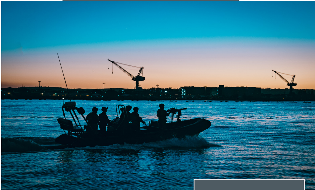
On patrol with the M134D