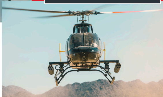
407 in Duals Configuration