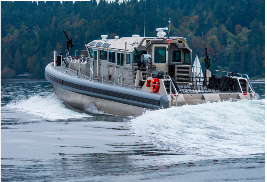
The M134D mounted at the Starboard and Port Amidship