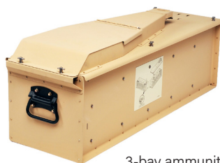
3-bay ammunition can with rollers