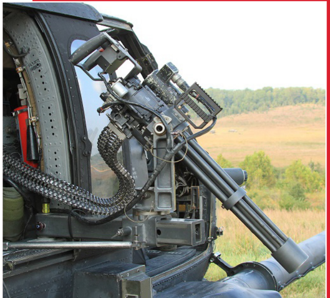
Crew served M134D Minigun on an MH-60, system is compatible with UH-60 A, L, M, S-70i Models