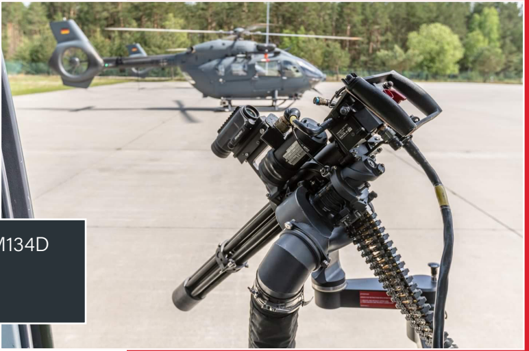
Crew served M134D Minigun on an Airbus H145