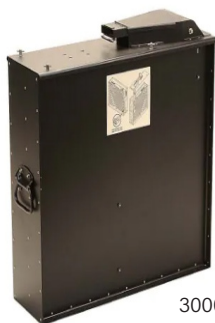
3000 round M134 magazine

Dillon Aero Magazines are designed to ensure flawless ammunition feeding for all weapons to include the high rate of fire M134D Minigun.