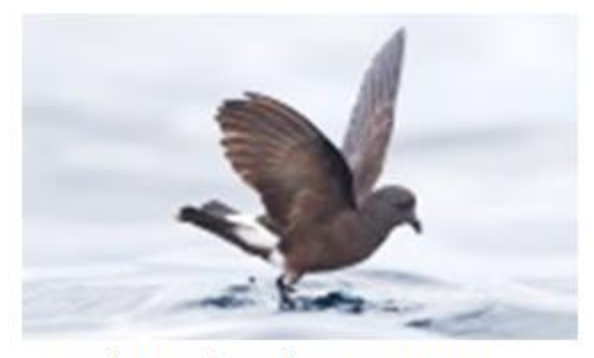
Oceanites oceanicus (Wilsons Storm Petrel)