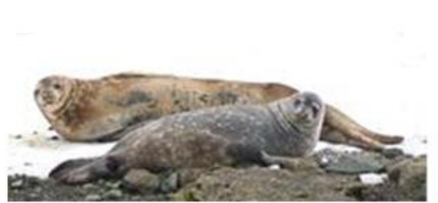
Leptonychotes weddelli (Weddell Seal)