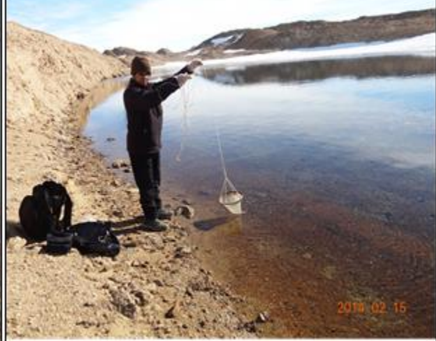
Algae in water logged area and from water body of Larsemann Hills, Antarctica