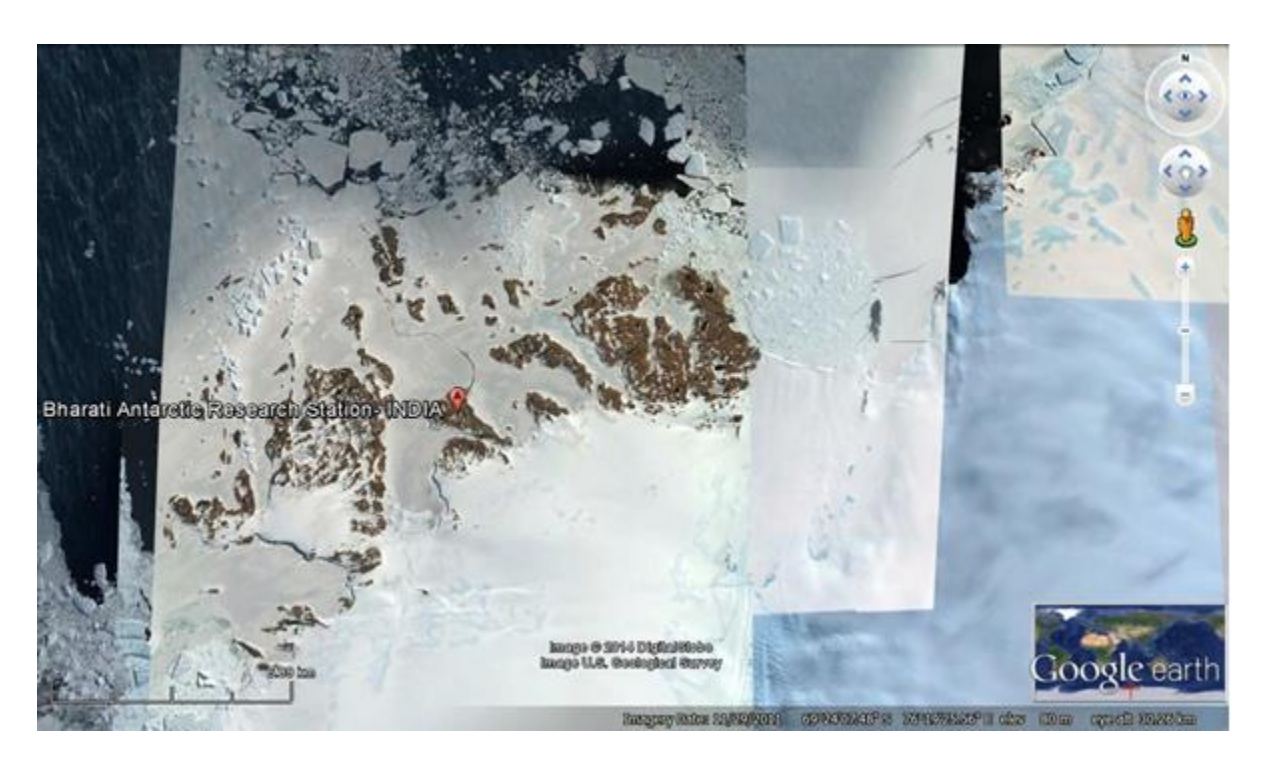
Figure 2 Satellite Imagery Map of Larsemann Hills, Antarctica

Coastal location and ice free landscape in Larsemann Hills area attracted human activity as tourist visit and its potentials for scientific researches induced human activity is affecting the diversity of this area. The Antarctic climate/environment is super susceptible to the impacts of human activities and has negligible natural ability to recover from disturbance than the environment of other continents. So the primary study of biodiversity in this area before impact of human activity is of valuable significance.