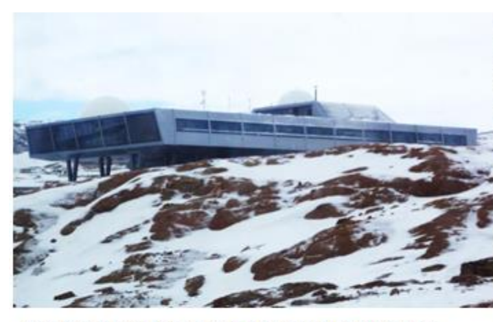
Indian Research Station Bharati, Larsemann Hills, Antarctica