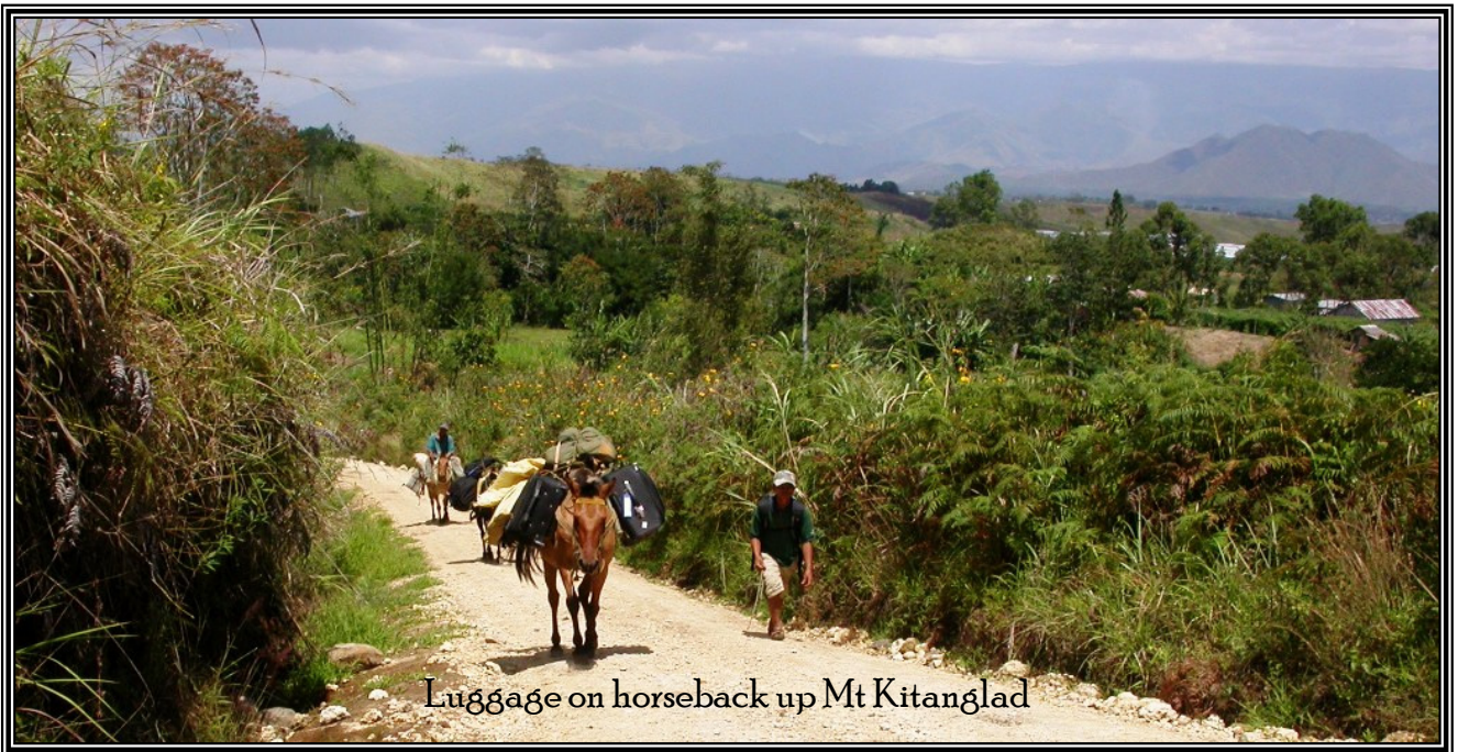
Luggage on horseback up Mt Kitanglad