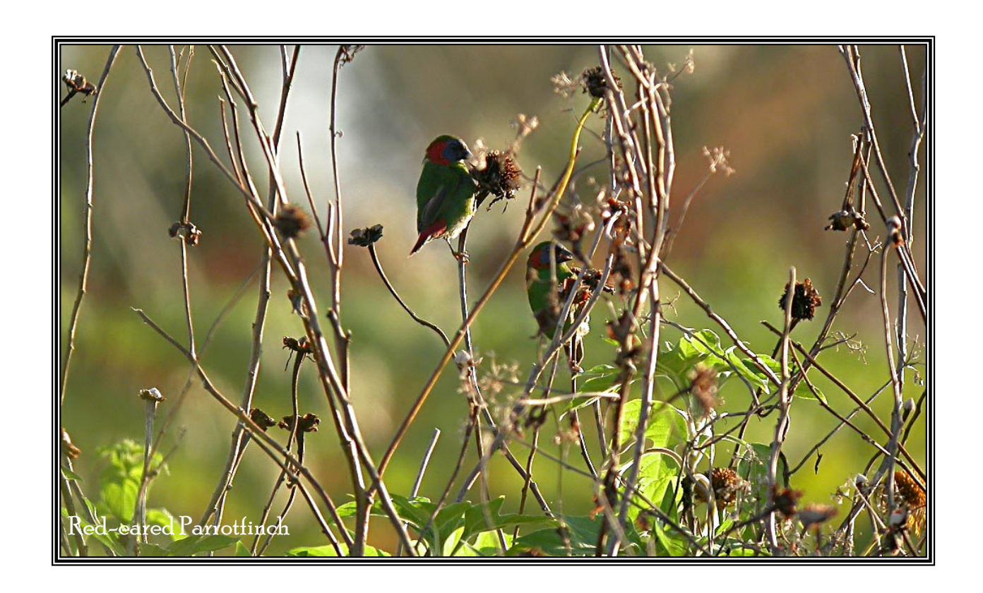
Shrike 2, Short-tailed Glossy Starling 10, Red-eared Parrotfinch 2, Chestnut Munia 10.