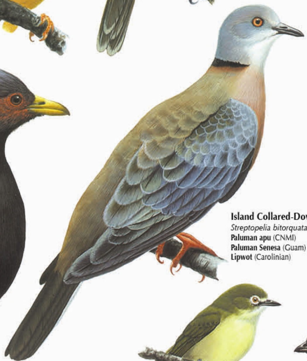
Island Collared-Dove Streptopelia bitorquata Paluman apu (CNMI) Paluman Senesa (Guam) Lipwot (Carolinian)