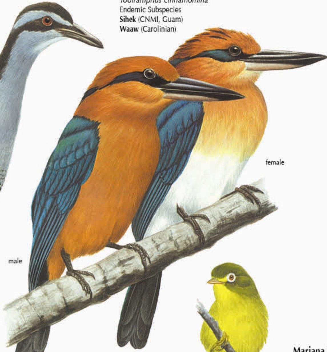
Micronesian Kingfisher Todiramphus cinnamomina Endemic Subspecies Sihek (CNMI, Guam) Waaw (Carolinian)