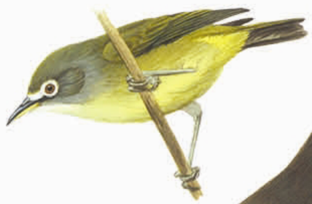
Bridled White-eye (Guam) Zosterops conspiciata conspiciata , Endemic Subspecies Nosá' (Guam)