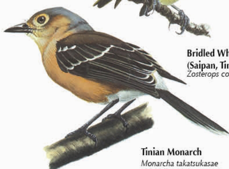
Tinian Monarch Monarcha takatsukasae Chichirikan Tinian (CNMI) Liteighi'par (Carolinian)