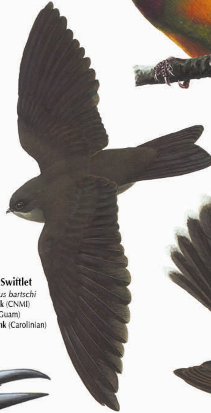
Mariana Switlet Aerodramus bartschi Chachaguak (CNMI) Yayaguak (Guam) Leghe'kiyank (Carolinian)