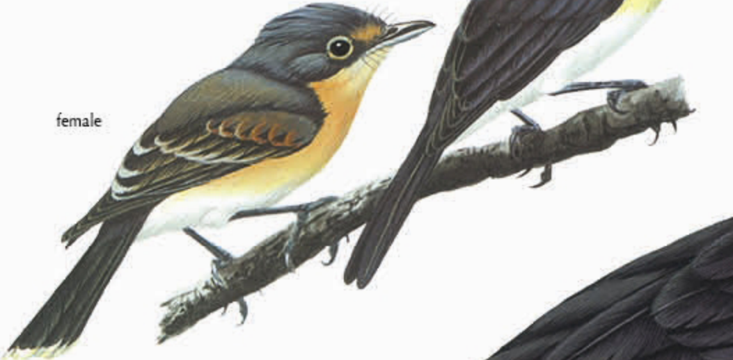
Guam Flycatcher Myiagra freycineti , Endemic Species Chuguanguang (Guam)