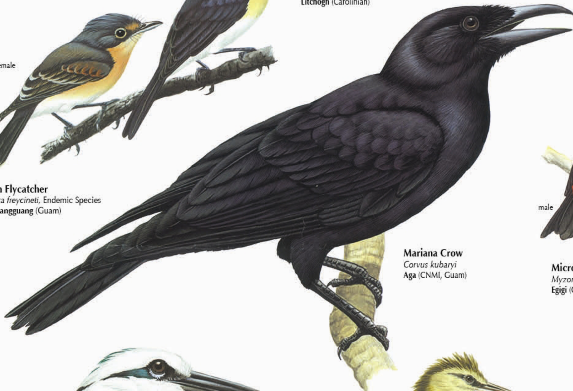
Mariana Crow Corvus kubaryi Aga (CNMI, Guam)