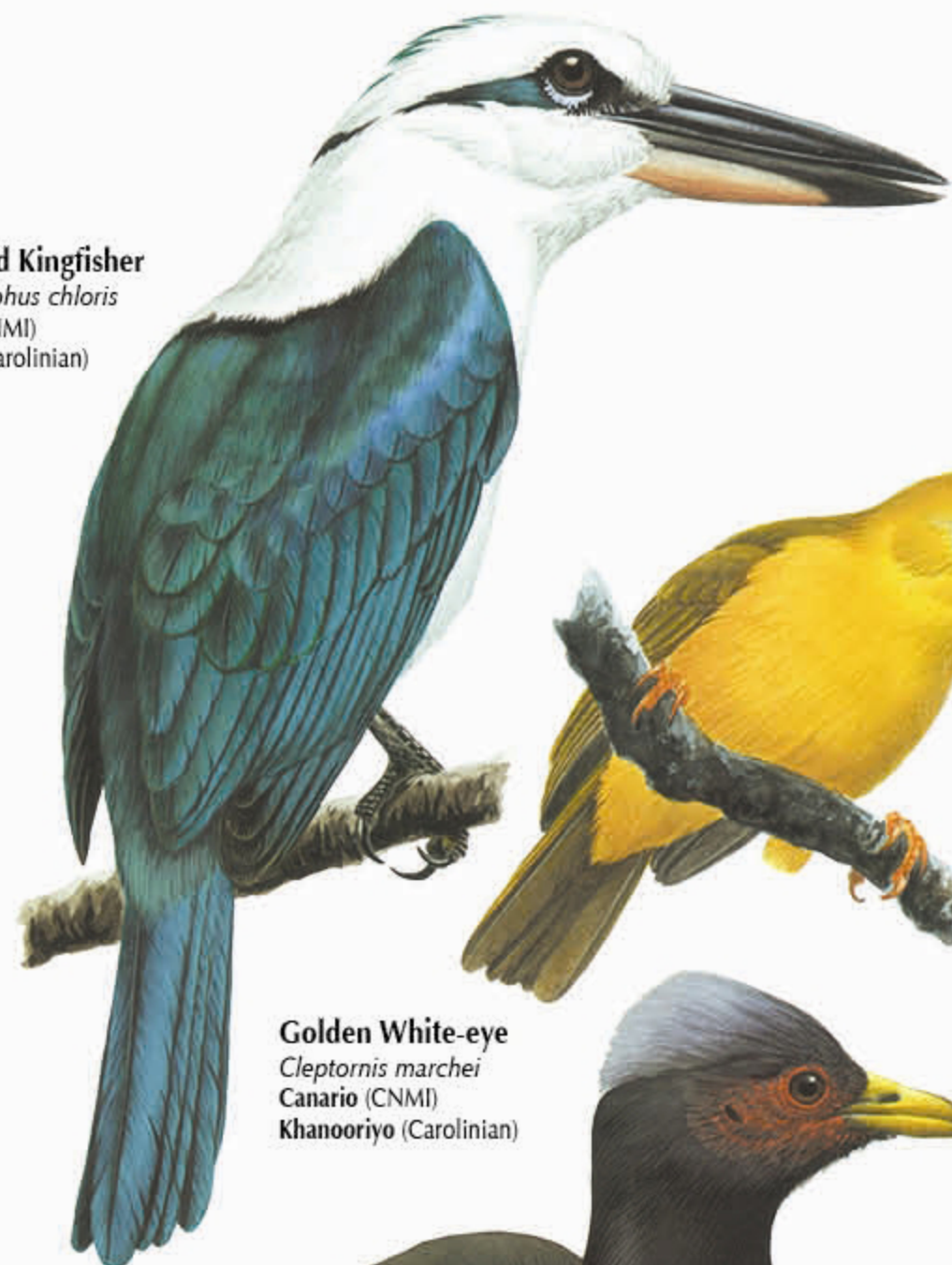
Collared Kingfisher Todiramphus chloris Sihek (CNMI) Waaw (Carolinian)