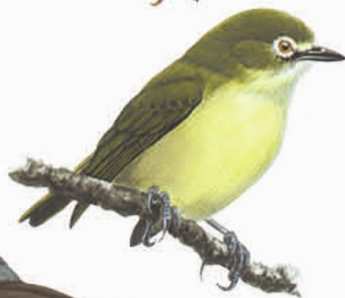
Bridled White-eye (Saipan, Tinian) Zosterops conspiciata saypani