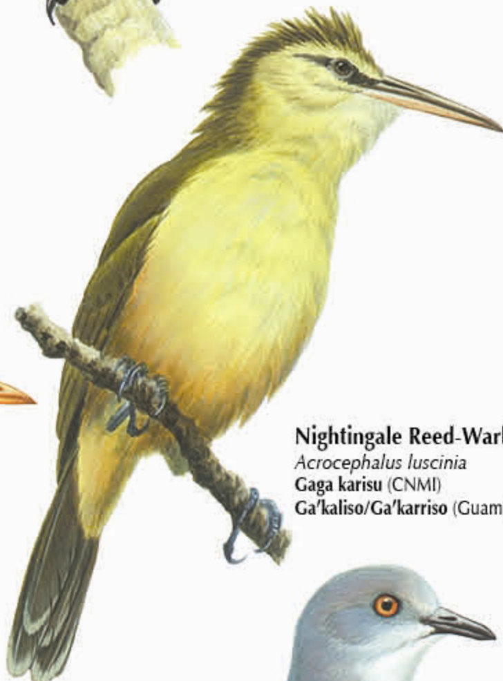
Nightingale Reed-Warbler Acrocephalus luscini Gaga karisu (CNMI) Ga'kaliso/Ga'karris (Guam)