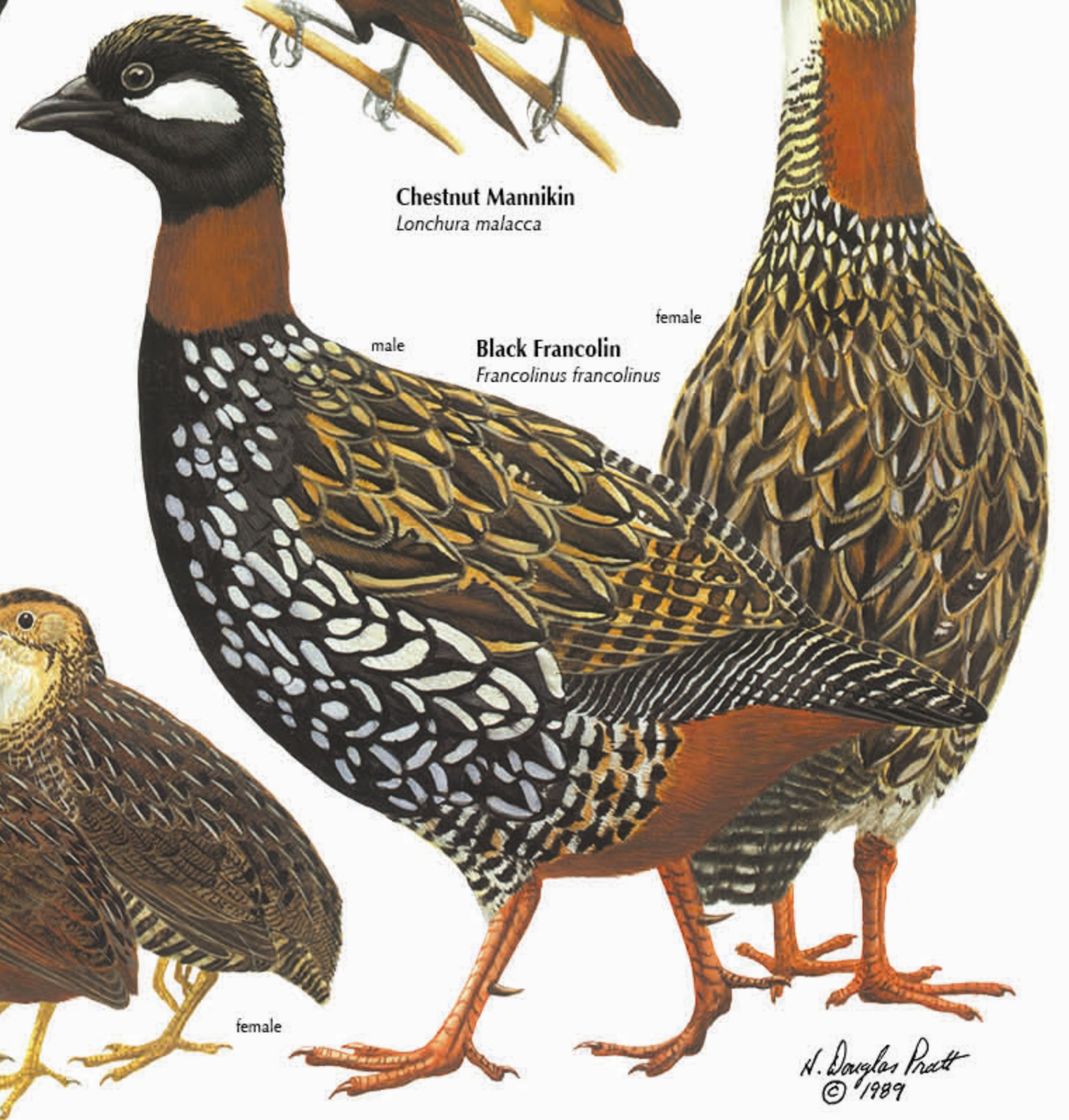
Black Francolin Francolinus francolinus