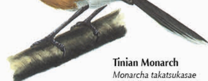
Tinian Monarch Monarcha takatsukasae Chichirikan Tinian (CNMI) Liteighi'par (Carolinian)