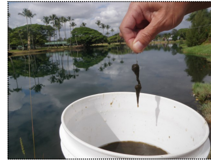
Tandem hooks baited with chain diatoms to catch 'ama'ama in Wailoa River, Hilo Hawai‘i