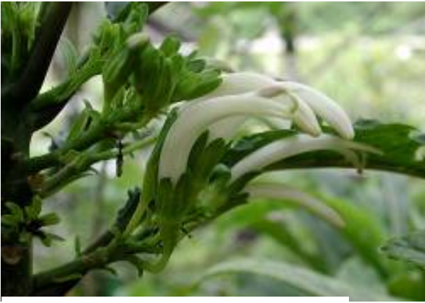
Warren L. Wagner, © Smithsonian, 2005