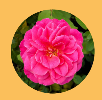
Rosa American Legacy $25 | 1 Quart

Bright blooms come in flushes throughout the season. The shrub itself is moderately sized and packed with luscious green foliage. H: 2-3' W: 2-3'