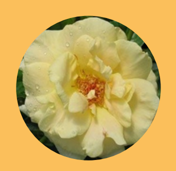
Rosa Prairie Harvest $25 | 1 Quart

Pointed buds open to fragrant, yellow blooms that continue all season. May bloom singly or in large clusters against thick, foliage. H: 4-6' W: 3-4'