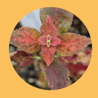
Coleus 'Stella Red' $6 | 4 Inch Mottled red leaves with gold and purple flecks

Coleus 'Surrender Dorothy' $6 | 4 Inch Slightly scalloped leaf edge with green, coral, magenta and maroon leaves.