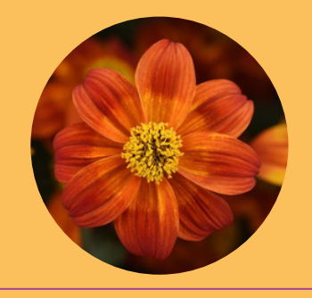
Bidens ferulifolia | Beedance® Painted Red bidens $10.50 | 4 Inch Colorful red flowers with a yellow center. Deadheading not necessary. H: 8-12" W: 10-24"

Bidens ferulifolia | Namid™ Red+Yellow Eye bidens $9.50 | 4 Inch