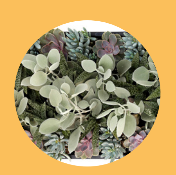
Flip Flops and Fireflies Succulents $3 | 2 Inch Charming succulent collection. Photo reproduced with permission from Garden Solutions.

Bonfires and Beaches Succulents $3 | 2 Inch Charming succulent collection. Photo reproduced with permission from Garden Solutions.