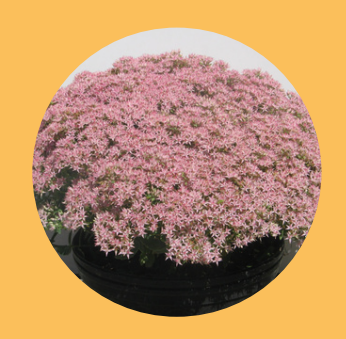
Sedum x 'Pure Joy' | sedum $14 | 1 Gallon

Blue green foliage reminiscent of Sedum sieboldii in tight compact clumps only reaching around 12" high and up to 15" wide. Soft bi-color pink flowers begin in September. Full sun well drained soil is best.