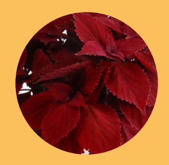
Coleus 'Main Street: Beal Street' $10 | 4 Inch Deep red leaves. H: 24-36"