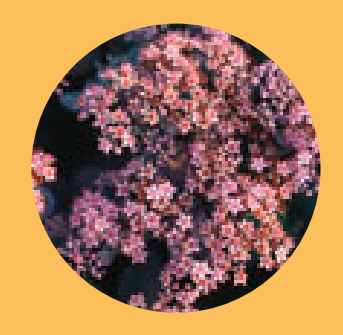
Sedum 'Vera Jameson' | stonecrop $4 | 2.5 Inch

Brightly colored, rosy flowers from late summer into fall; tight growth habit and thicker foliage. Requires excellent drainage. H: 24-30" W: 18-24"