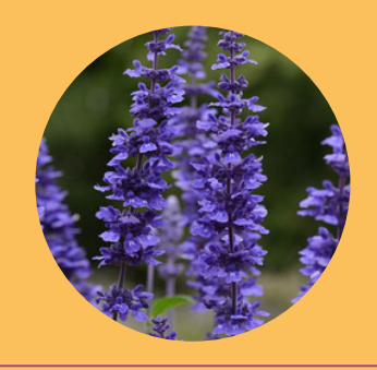
Salvia 'Mystic Spires' | sage $11 | 4 Inch Everblooming purple-blue flower stalks. H: 2-3' W: 2-3'

Salvia longispicata x farinaceaRockin'® Playin' the Blues® | sage