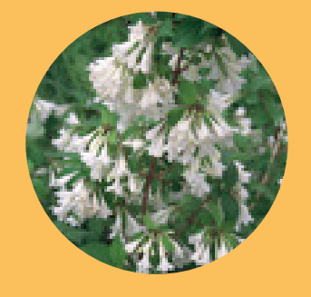
Weigela praecox 'April Snow' | weigela $10 | 1 Quart

White selection made from seed collected on the Wutai Shan (mountains) in China. Rare, spring flowering shrub. H: 6' W: 4-6"