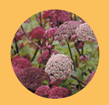
Angelica gigas | Korean angelica $4 | 2.5 Inch

Exciting species with unique, purple flower heads and purple stems; near white flowers from July-August. Biennial; used as an ornamental. H: 4' W: 4'