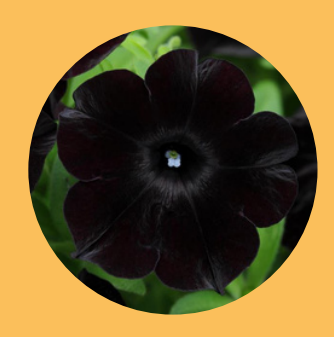
Petunia 'Black Magic' | petunia $9 | 4 Inch Dark black blooms. H: 10-16" W: 16-20"

Portulaca oleracea 'Pazazz™ Nano Fuchsia | moss rose' $10.50 | 4 Inch Large fuchsia blooms over green succulent foliage. Trailing habit suitable for baskets. H: 3-4" W: 18"