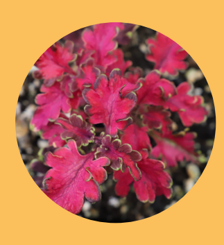
Coleus 'Frilly Magenta' $6 | 4 Inch Frilly, scalloped leaf edge with fusia color and lime edge