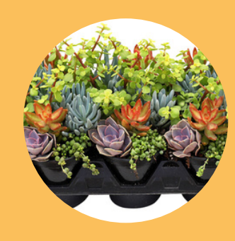
Backyard Bonfire Succulents $8 | 4.25 Inch Charming succulent collection.

Faintly scented, blue-violet flowers in racemes of 30-50 are densely packed on current season's growth. Long, shiny seed pods add interest in late summer and fall. H: 12-18' W: 4'