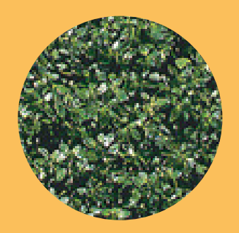
Herniaria glabra | rupturewort $4 | $2.5 Inch