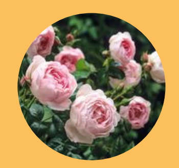
Rosa 'Ausland' Scepter'd Isle $25.50 | 1 Gallon

Bears numerous cupped flowers, with yellow stamens. The light pink becomes paler on the outer petals, and has a myrrh fragrance. It forms an upright shrub. H: 5' W: 4' Repeat bloomer