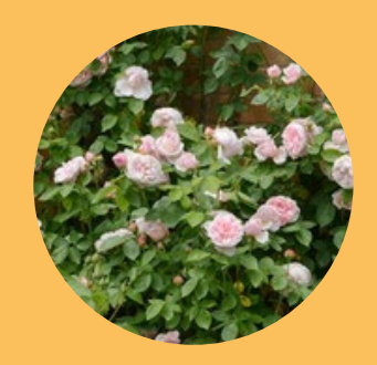
Rosa 'Auswuth' St. Swithun $25.50 | 1 Gallon

A short, vigorous climber bearing large, saucer-like blooms, each with over one hundred frilly petals. The soft pink pales to blush towards the edges. There is a medium-strong myrrh scent. H: 10'