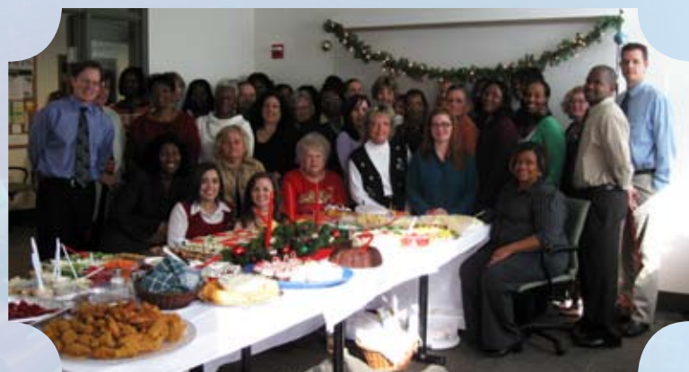
Administration celebrated this year's holiday season with a feast and festive decorations Dec. 9.