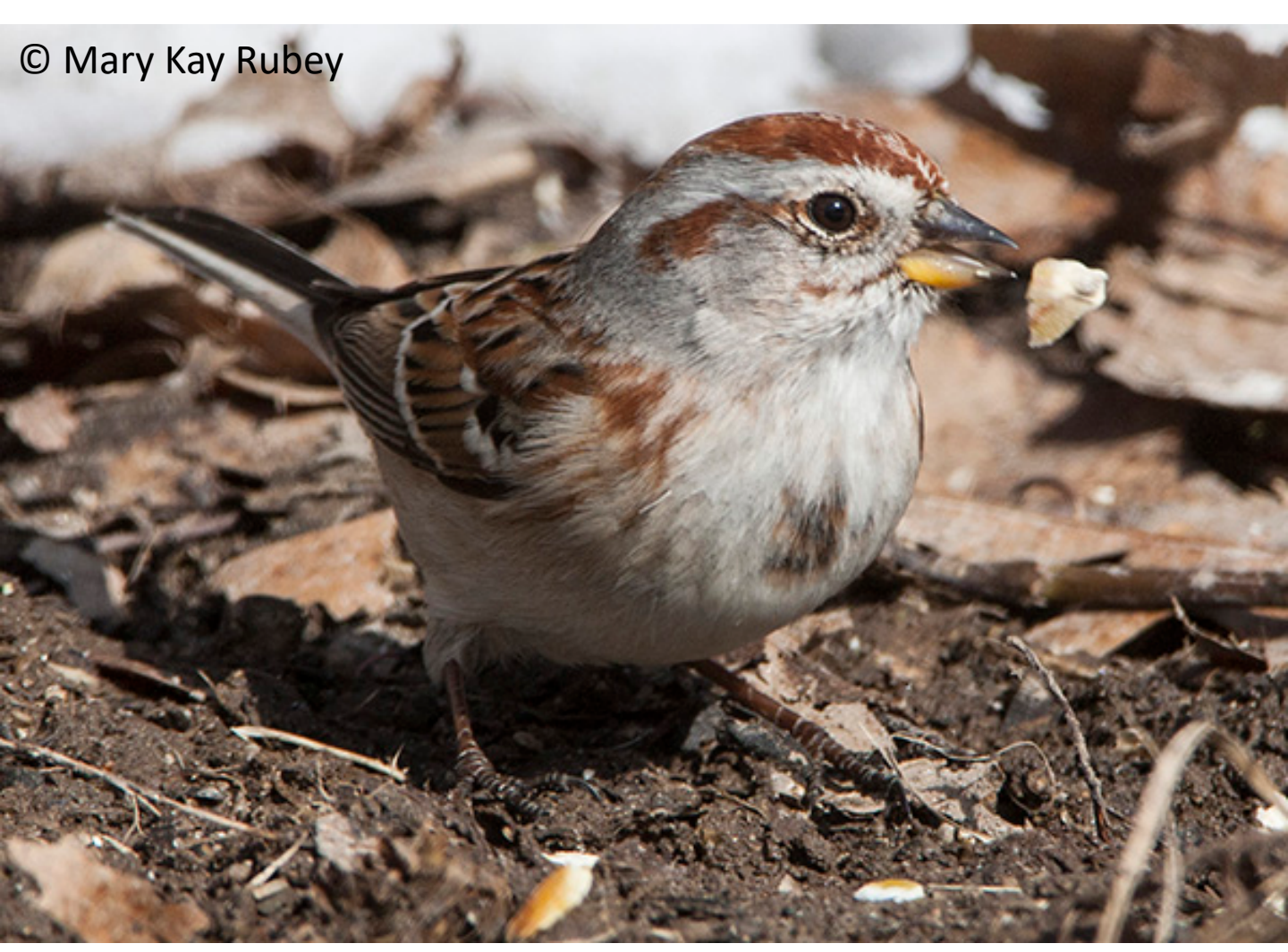
© Illinois Department of Natural Resources. 2020. Biodiversity of Illinois . Unless otherwise noted, photos and images © Illinois Department of Natural Resources.