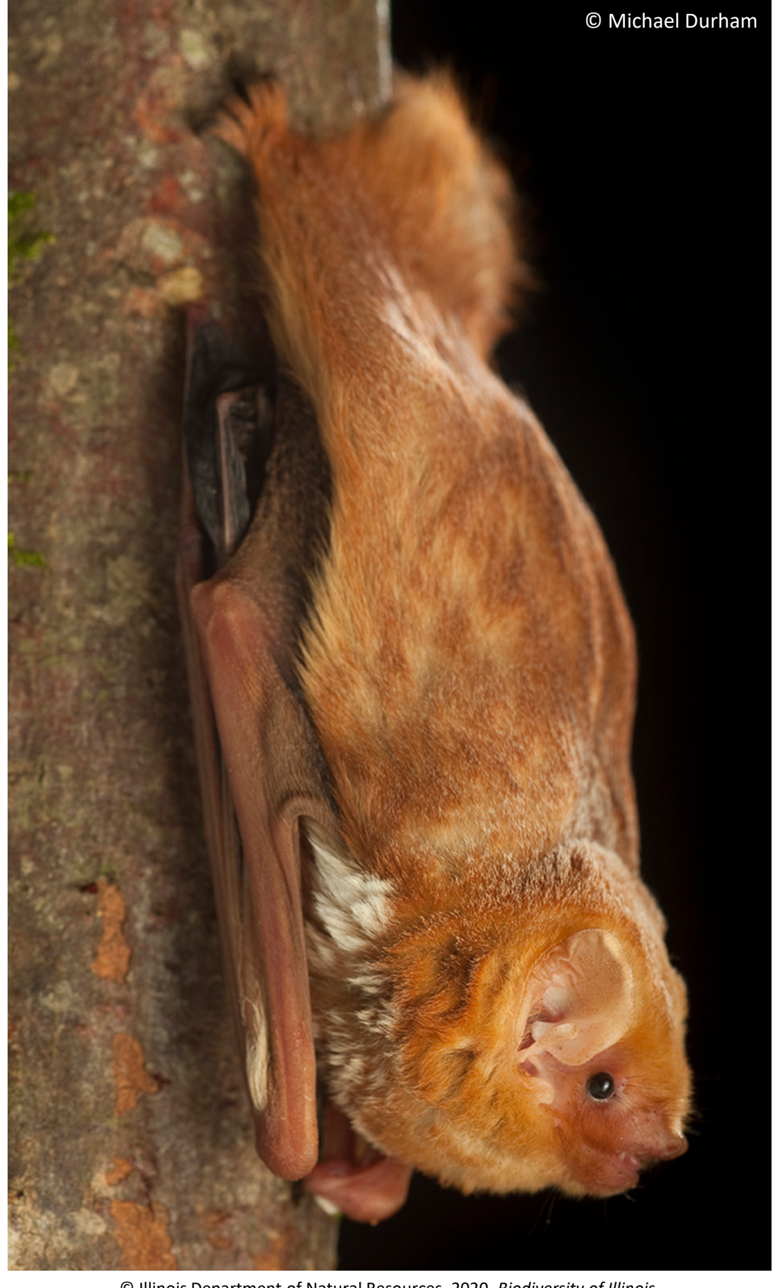
© Illinois Department of Natural Resources. 2020. Biodiversity of Illinois . Unless otherwise noted, photos and images © Illinois Department of Natural Resources.