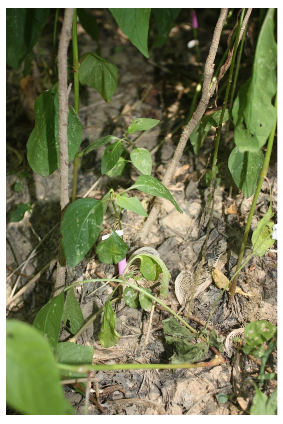
Photo 3. Tagged seedling of Iresine\ rhizomatosa at Beall Woods Nature Preserve. July 24, 2012.