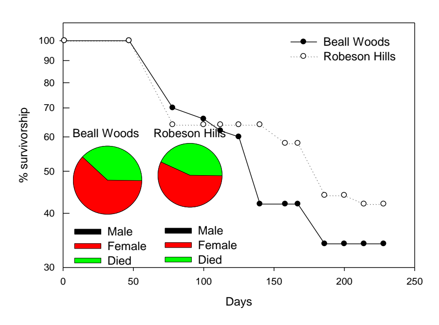
Figure 1. Survivorship of Iresine rhizomatosa seedlings emerging in 2012 through 230 days.