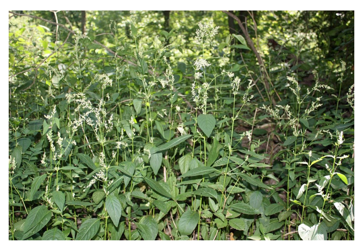
Photo 1. Flowering population of Iresine\ rhizomatosa at Beall Woods Nature Preserve. July 24, 2012.