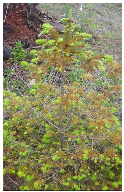
Figure 10. Seedling highly susceptible to Rhabdocline needle cast. Note the brown color of infected 1-year needles and bright green color of the emerging current year needles. Photo by Nicholas Wilhelmi, USDA Forest Service.

increasing the dewpoint temperature in the crown. This will help to make conditions less conducive to the dispersal of spores and infection by Rhabdocline . Thinning also provides an opportunity to cull visibly diseased individuals and favor the healthier, better performing trees. In areas of high-disease risk this may mean favoring alternate species as Douglas-fir is the only host for this disease.