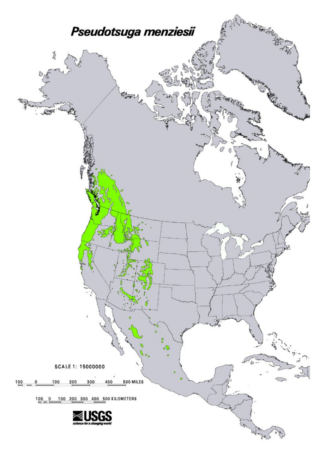
Figure 2. Natural range of Douglas-fir (Pseudotsuga menziesii) (Little 1971; Thompson 1999).