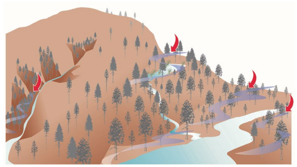
Figure 4. Cool air drainage and humid air pooling are characteristic of mountainous terrain. Conditions for foliage diseases such as Rhabdocline needle cast may be increased in areas of humid air pooling. Red arrows indicate direction of air flow (in absence of wind) and grey wisps indicate possible fog or humid air accumulation. Illustration by Gretchen Bracher from Managing Insects and Diseases of Oregon Conifers (EM 8980), © 2018 Oregon State University.

apothecium formation on a needle. For instance, R. epiphylla apothecia are predominantly on the upper (adaxial) needle surface, while R. pseudotsugae apothecia are on the lower (abaxial) needle surface, and only rarely on the adaxial surface (table 1, fig. 5). While the apothecia of R. weirii and R. oblonga may be found on 1-year-old needles, the apothecia of R. obovata are only found on needles 2-years-old and older. The