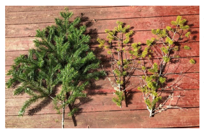
Figure 8. Comparison of foliage retention and color on a branch from a healthy tree (left) and branches from a tree with Rhabdocline needle cast symptoms (right). The branch on the left has greater than 2 years of foliage remaining, while the branches on the right have only 1 year of foliage.

be as high as 50 percent. Radial growth of trees with moderate to severe Rhabdocline infection (70–90 percent of crown infected) is estimated to be 50–65 percent of that of healthy, uninfected trees. Reduction in height growth for trees with severe infection is estimated to be as high as 70 percent. Severe infections will affect the value of trees in Christmas tree markets and may render many infected trees unmarketable due to crown discoloration and reduced density associated with poor needle retention pre- and postharvest.