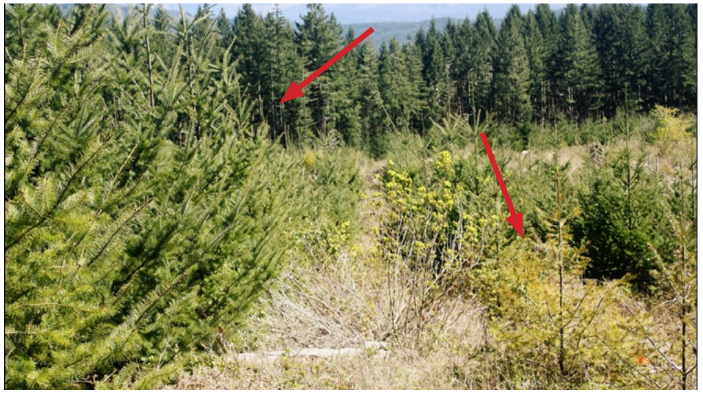
Figure 9. Resistant Washington coast seed source (left) planted next to a highly susceptible seed source from a drier, northern California region (right) at a low-elevation site in Oregon's southern Cascades.

It is generally accepted that the use of locally adapted seed sources is the most effective way to prevent Rhabdocline needle cast in forest plantations. Seed sources from outside the range of their natural habitat and climate conditions will, in general, be much more susceptible to Rhabdocline needle cast and other foliage diseases (fig. 9). Planting trees in environments similar to their native environments will help to ensure they have been exposed to and developed a tolerance and or resistance to pathogens that also prefer that environment. Utilizing established tree seed transfer zones will aid in the identification of optimal seed sources for a given site.