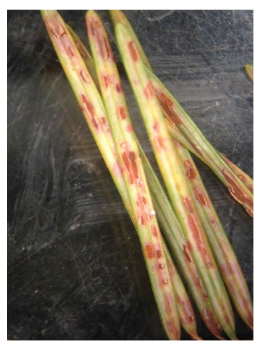
Figure 3. Apothecia of Rhabdocline on Douglasfir needles.

Rhabdocline is an ascomycete fungus that produces spores in microscopic sacs known as asci. The asci of Rhabdocline develop within structures called apothecia (sing. apothecium), which erupt through the epidermis of the host needle (fig. 3). Ascospores are released in