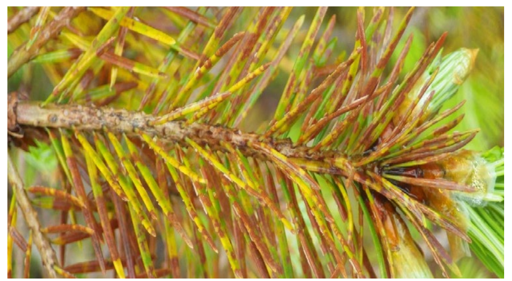
Figure 1. Foliage of Douglas-fir with severe Rhabdocline infection. Notice the reddish-brown fruiting bodies and mottled green, yellow, and brown appearance of infected foliage.

Rhabdocline are specific to Douglas-fir, however, one species, R. laricis , is specific to larch ( Larix spp.) and is the cause of larch needle cast. This species was formerly known as Meria laricis , and unlike other Rhabdocline species, is only known to reproduce asexually. This publication focuses on Rhabdocline spp. that are specific to Douglas-fir and are