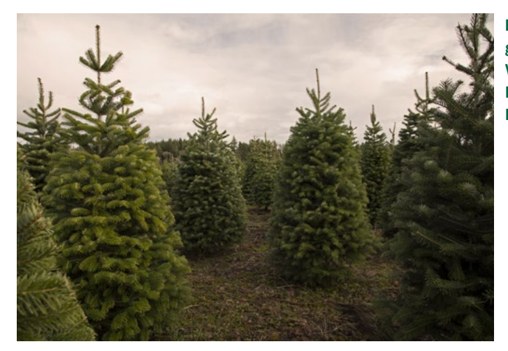
Figure 11. Douglas-fir trees growing on a tree farm in the Willamette Valley, Oregon.

The management strategies outlined for operational forest plantations, other than the unfeasibility of the use of fungicides, also apply to Christmas tree growers (table 2). An integrated pest management (IPM) strategy is best used, and fungicides can be targeted for the final 3 years of growing to enhance crown fullness. It is important to establish a threshold to determine when Rhabdocline needle cast has become an economic threat. This will aid in management decisions regarding Rhabdocline. Contact your regional pathologist or extension agent for additional information and recommendations relating to fungicides.