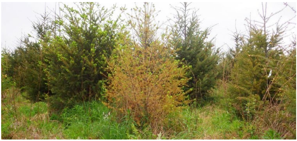
Figure 7. Heavily infected, highly susceptible tree planted among trees that are tolerant or resistant to Rhabdocline needle cast.