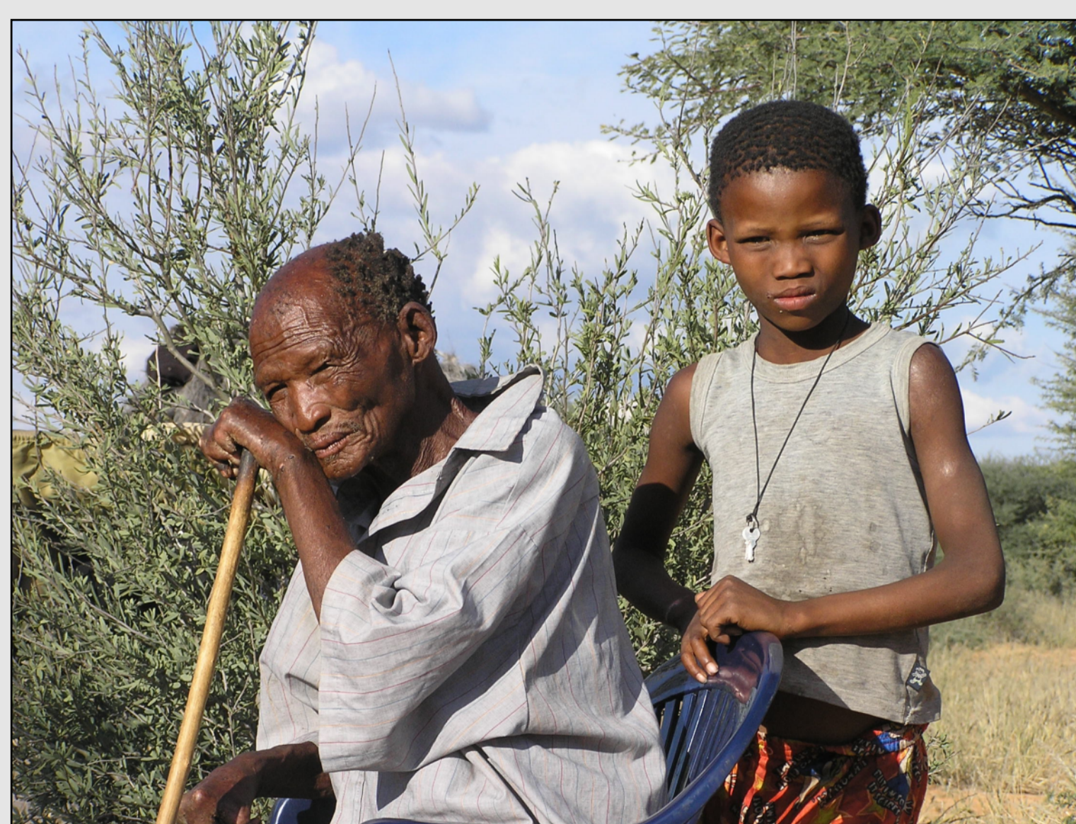
Man and boy listening to a storyteller.

Taa is the last vital language of the Tuu language family - formerly called 'Southern Khoisan' - and spoken by about 3 000 people in Namibia and Botswana. It is famous for an extremely large repertoire of speech sounds, i.e., it has been cited as the language with the largest known inventory of consonants (122 consonants) or phonemes (160 segments). This is mainly due to the contrastive use of clicks (ǀ, ǁ, ǃ, ǂ as basic types) and nine series of stops (contrastive use of voicing, aspiration, ejection/glottalization and prenasalization). With an analysis that treats various syllable onsets as consonant clusters (such as [tχ] analyzed as /t+χ/ instead of /tχ/), the consonant inventory can be reduced to about 88 segments.