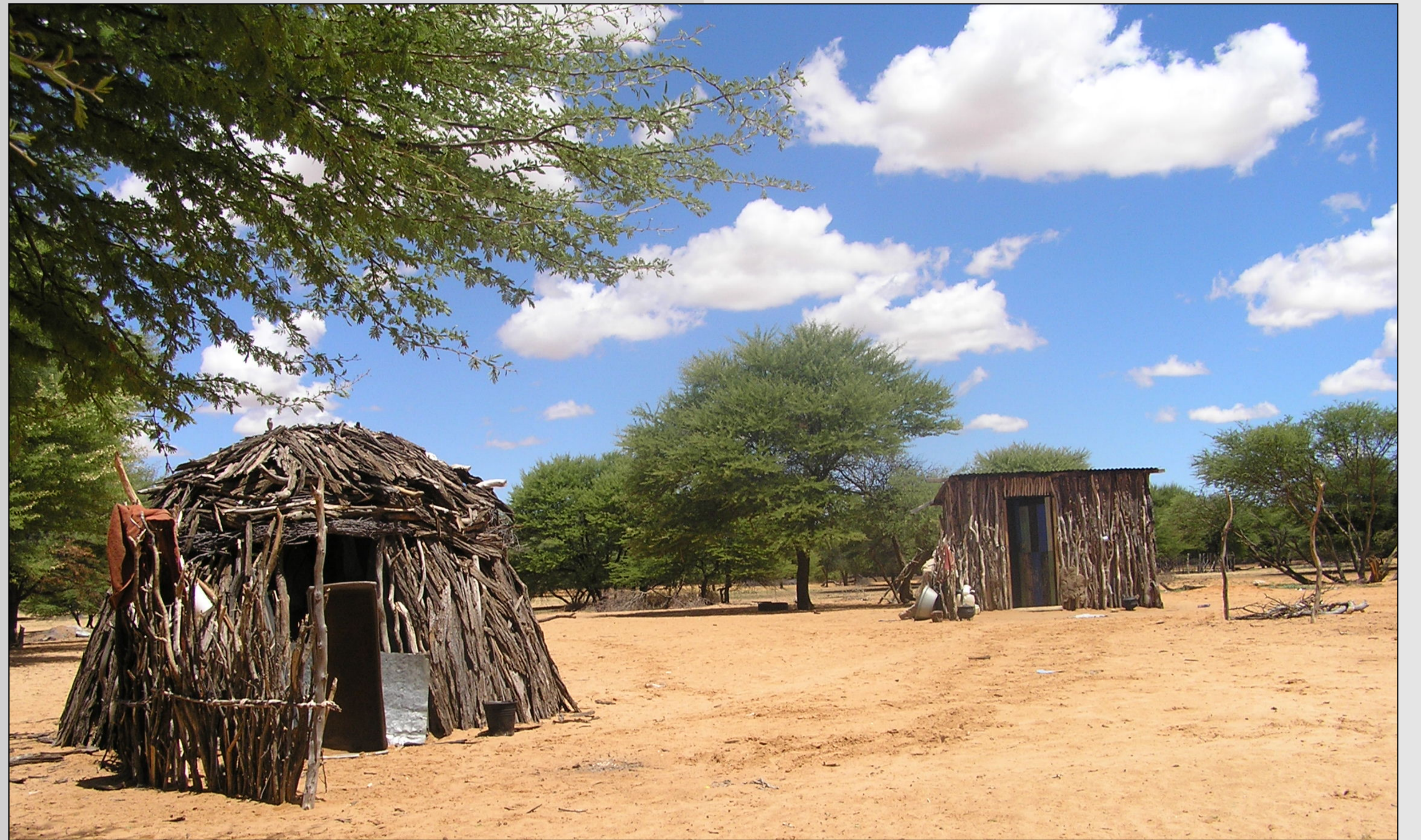
Homestead of a !Njoha family, comprising traditional and modern houses.

Taa shares several typological features with other Khoisan languages of the area, such as lexical stems largely restricted to the phonotactic patterns C(C)V(C)V and C(C)VN, or little bound morphology. The basic constituent order is Subject - Predicate (- Object) (- Adjunct),