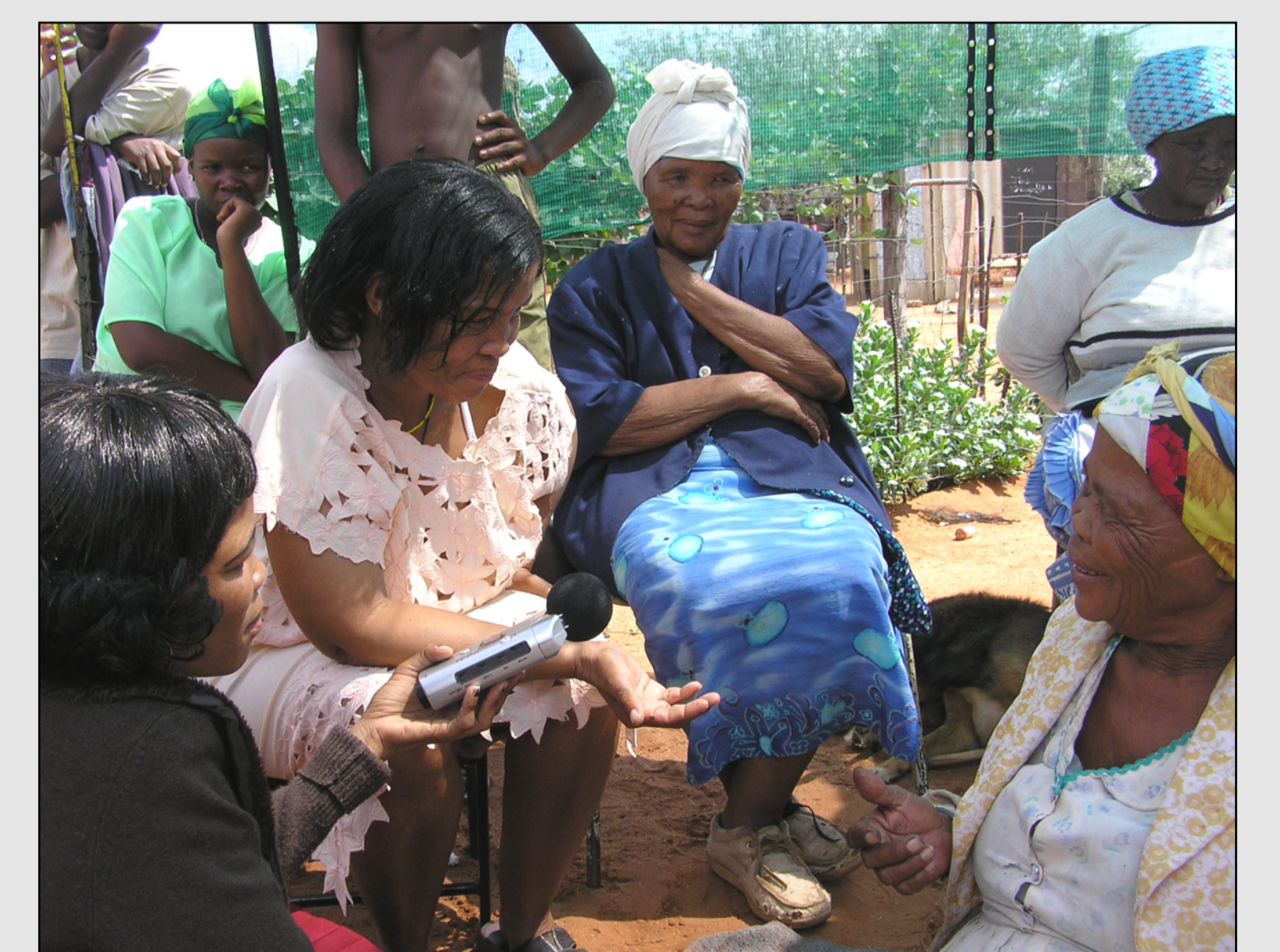
Two !Xoon ladies from Corridor 18 (left) interviewing a remnant speaker at Leonardville.

Activities carried out in order to support the speech community especially in Namibia for the promotion and official recognition of the Taa language included the organization of meetings with officials and NGOs, computer training, and several orthography workshops.