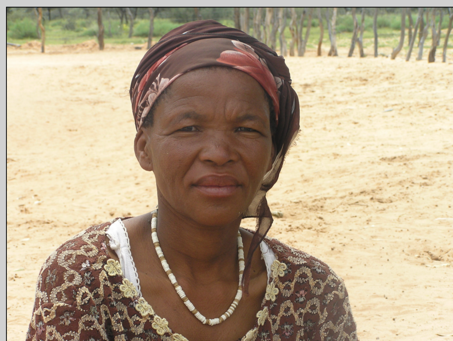
Taa lady from Phuduhudu.

whereby adjuncts are often marked by a default preposition ('multi-purpose oblique marker'). An outstanding feature of Taa is that nouns fall into several genders that are conveyed by agreement classes. These are consistently indexed on dependent forms by means of segmental agreement markers (concord), such as -i (agreement class 1) in #hai #u-i [dog.1 one-1] "one dog" or -e (agreement class 3) in n||àhè #u-e [house.3 one-3] "one house".