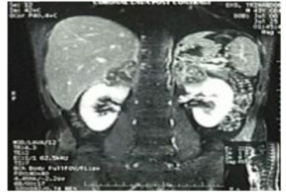
Fig. 1. Hyper pigmentation lip oral mucosa, nail, MSCT bilateral adrenal hyperplasia.