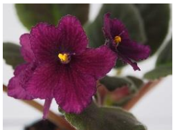
Crushed Velvet (G. Boone) Semi double burgundy frilled pansy. Dark green, plain. Semi miniature