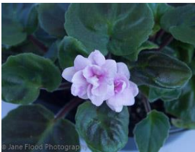
Rob's Vanilla Trail (R Robinson) Double cream to blush white pansy. Dark green, serrated, pointed. Semi miniature Trailer.