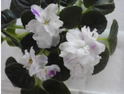
Ness' Puppy Dreams (D. Ness) Semi double white and pink pansy. Medium green, quilted. Semi miniature