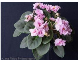
Orchard's Bumble Magnet (R. Wilson) Double pink star. Medium green, plain, pointed. Miniature

Optimara Little Pearl Single-Semi double blush white. Medium green, heart shaped to ovate, pointed, hairy, glossy leaf, Miniature