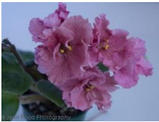
Ness' Sheer Peach (D. Ness) Semi double-double peach pink pansy. Medium green, plain. Semi miniature.

Optimara Little Pearl Single-Semi double blush white. Medium green, heart shaped to ovate, pointed, hairy, glossy leaf, Miniature