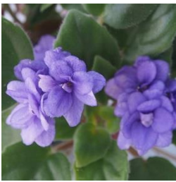
Rob's Wagga Wagga (R. Robinson) Double dark blue sticktite/variable white marking. Medium-dark green, plain, pointed, serrated. Semi miniature trailer