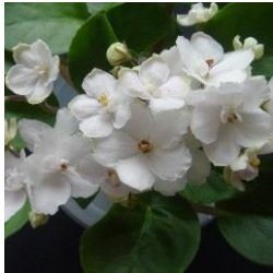
Christening Gown (S. Sorano) Semi double white frilled pansy. Dark green. Semi miniature