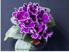
Kinglake (S Gardner) Single-semi double dark pink-plum/white band, thin green edge. Dark green, serrated/red back. Semi miniature. (Aust)