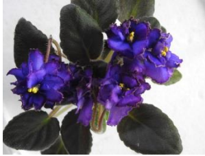
Rob's Mad Cat Double pink sticktite pansy/blue fantasy, dark red-purple ruffled edge. Dark green, serrated/red back. Semi miniature.

Rob's Boogie Woogie Semi miniature medium shell pink pansy. Crown variegated dark green and tan-beige, pointed/red back. Semi miniature.