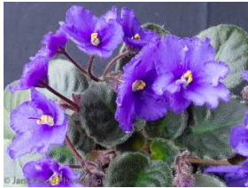
RD's True Blue Single-semi double medium blue pansy. Dark green/red back. Miniature

Rob's Bed Bug Double dark red pansy. Crown Variegated dark green, pink and beige/red back. Semi miniature.