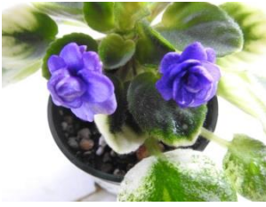
Rob's Shadow Magic Semidouble dark blue. Crown variegated medium green and gold, pointed, glossy, serrated. Semi miniature.