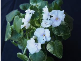
Rob's Silver Spook (R Robinson) Semidouble white and light lavender. Crown Variegation medium green, pointed. Semi miniature.