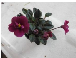
Dancin' Trail Double red star. Dark green, pointed, glossy. red back. Semi miniature Trail