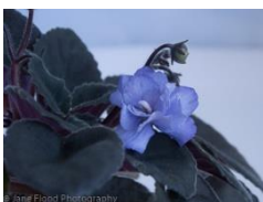
Minuet (M Taylor) Double lavender-blue/variable green edge. Dark green. Semi miniature.