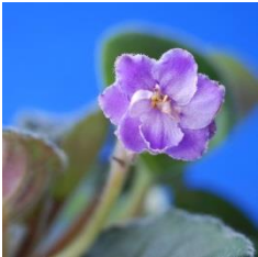
Magic Blue (H. Pittman) Double dark blue/white edge. Plain. Semi miniature

Little Pro Semi double pink. Dark green, quilted, pointed/red back. Semi miniature.