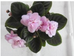
Miniver Rose Semi double pink. Dark green. Semi miniature.