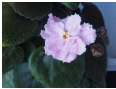
Rob's Puddy Cat (R. Robinson) Double creamy white to light pink frilled. Dark green, quilted, serrated. Semi miniature