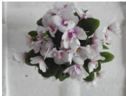
Childs Play Semi double white star/rose pink eye. Medium green, quilted.