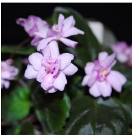
Pride's Pink Trail (C. Sotkiewicz) Double pink star. Black-green, pointed, quilted. Semi miniature trailer