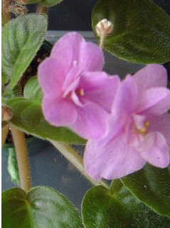
Sherbrooke (S. Gardner) Semi double-double bright pink pansy. Dark green/red back. Miniature