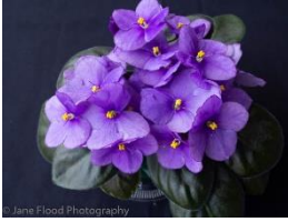
Kalorama (S. Gardner) Single-Semi double mauve pansy/dark pink eye, purple sparkle edge. Dark green/red back. Semi miniature