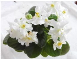
Midas Glow Semi double white star/yellow markings. Medium green, plain, quilted. Semi miniature.