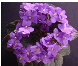
Rob's Scooter (R. Robinson) Semidouble medium blue-purple sticktite pansy. Dark green, pointed/red back. Semi miniature

Rob's Scrumptious (R. Robison) Semi double white star/dark pink patches. Crown variegated, medium green and white, quilted. Semi mini.