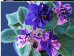
Prancing Pony (S. Sorano) Double dark pink pansy/dark blue fantasy. Medium green, plain, quilted.