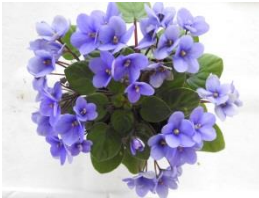
Marion's Enchanted Trail (H Pittman) Single medium blue. Dark green, plain. Semi miniature trailer.