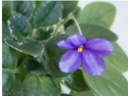
Bright Doreen (R Lee) CHIMERA Single chimera dark lavender star/white stripe. Variegated medium green and white, pointed. Miniature. Side shots only IF available ($5.00)