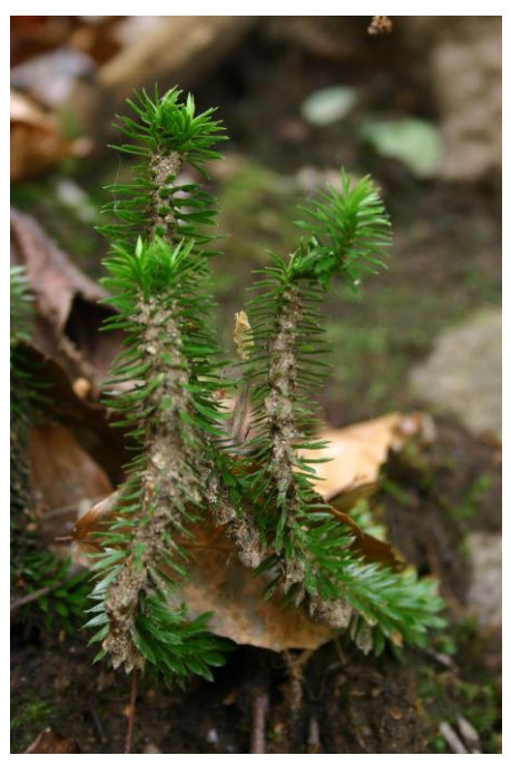
Huperzia lucidula, shining clumoss