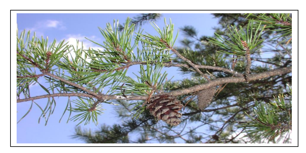
Pinus virginiana, Virginia pine