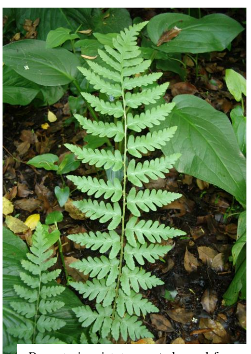
Dryopteris cristata, crested wood-fern