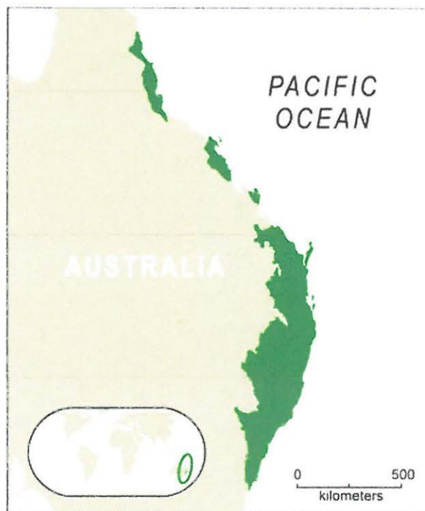
Fig. 16.1 Forests of East Australia Hotspot. Follows the boundaries of two WWF Ecoregions: the Queensland Tropical Rain forests in the north and the Eastern Australian Temperate Forests in the south

tablelands; undulating drier inland slopes and plains, particularly in north-west New South Wales; and naturally occurring freshwater lagoons and lakes.