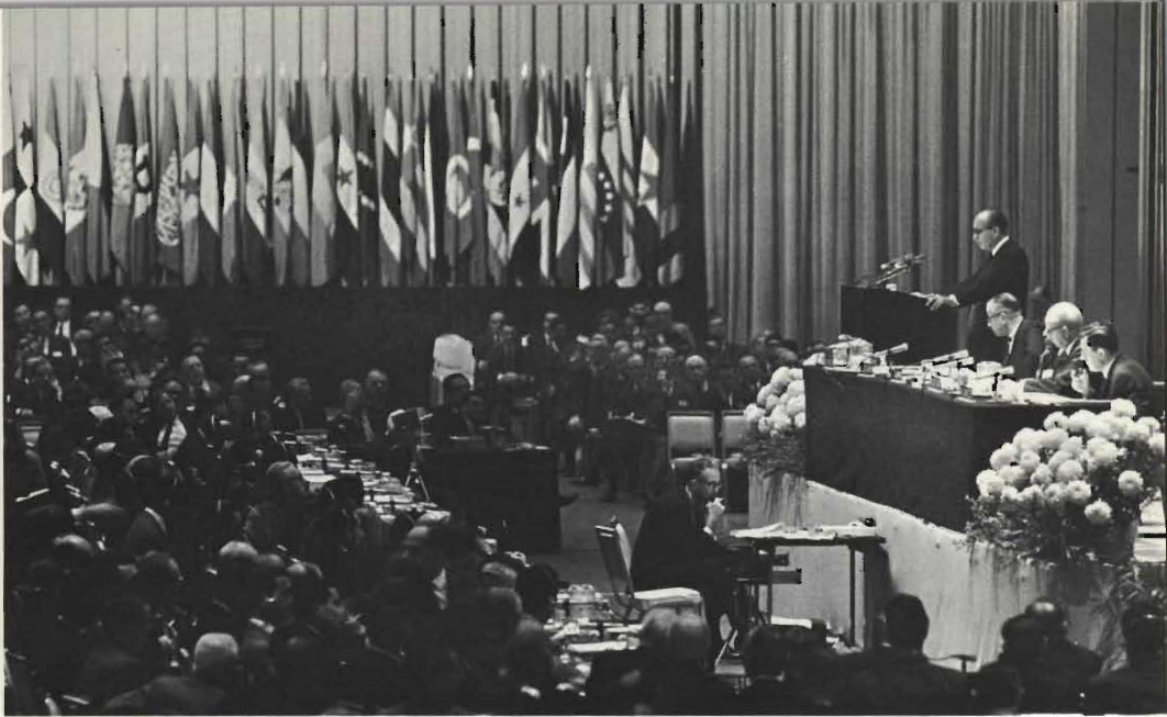
Mr. George D. Woods addresses the 1965 Annual Meetings in Sheraton Hall of the Sheraton-Park Hotel.