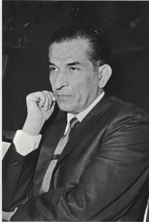
The Honorable Jamshid Amouzegar Chairman, Boards of Governors 1966 Annual Meetings