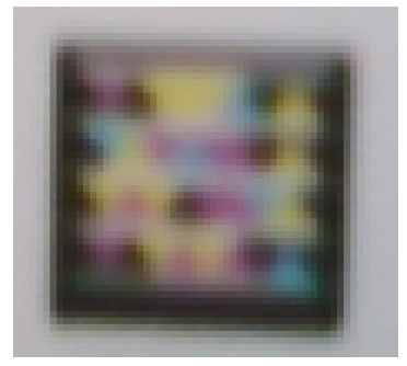
A successful scan using a Samsung Blackjack II handset. The size of the barcode square is about 40 pixels