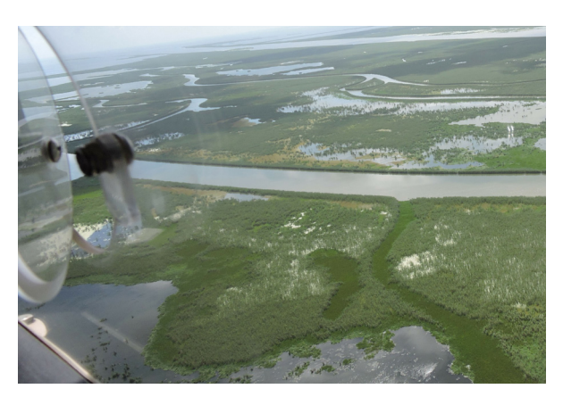
Open water visible through a thinning stand of roseau cane. Picture taken at the Bird's Foot Delta of the Mississippi River, Plaquemines Parish, Louisiana. The roseau cane scale has been implicated in damaging the stands.

Invasive species cause $120 billion in damage in the U.S each year, harming agricultural production, human habitation, forestland, wetland or native species. They threaten economic and ecological stability, displace native species and increase agricultural production costs.