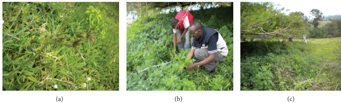
FIGURE 2: Diversity and life forms of plant species identified under Acacia sieberiana trees and in its surroundings: (a) open pastures, (b) under tree canopy, and (c) both under and away from the tree canopy.

trees, the area surrounding the pastures where animals are not allowed to graze freely does not have A. sieberiana saplings as well.