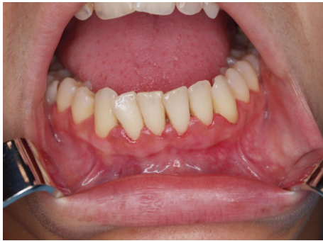
FIGURE 4: Clinical image of the lower anterior gingiva 3 weeks after CO 2 vaporisation procedure without recurrence.