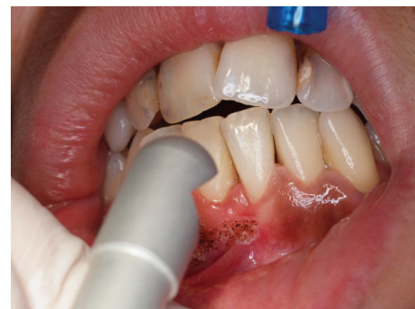
FIGURE 2: Vaporisation with CO 2 laser of gingival macules.

(Figure 2). During this procedure, safety precautions were in place to protect the operator, assistant, and patient. With this laser procedure, the secondary-intention healing of the surgical wound was reached without any dressing (Figure 3). Paracetamol (1 g every 12 hours) was prescribed for two days to be taken only if she developed painful symptoms. After 3 weeks, wound healing was completed uneventfully without any melanin pigmentation (Figure 4). She did not report any postoperative pain, swelling, or other complications. After two years of follow-up, the patient had no symptoms or signs of gingival melanin pigmentation.