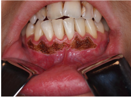
FIGURE 3: Clinical appearance after CO 2 vaporisation procedure.