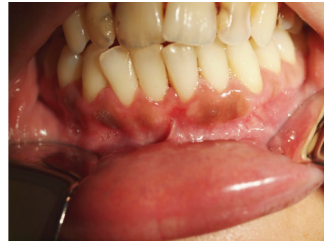
FIGURE 1: Initial clinical appearance with melanotic macules located on lower buccal gingiva.