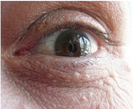
FIGURE 2: A grayish-white ring opacity occurring in the periphery of the cornea.

and tenolysis of the extensor tendon at the 4th and 5th MCP joints.