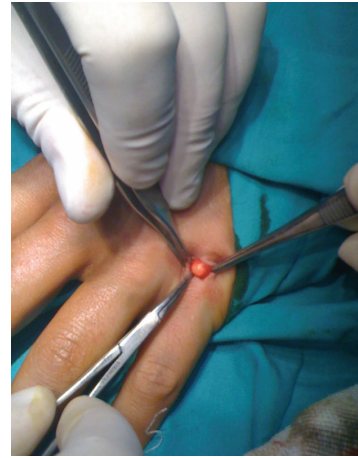
FIGURE 3: Intraoperative finding of the solid and yellowish mass at the extensor side of 5th metacarpophalangeal joint.

To our knowledge, this case is the first case in the English literature regarding xanthoma leading to restrained motion of the joints. It is also the first case presenting bilateral