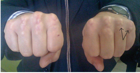
FIGURE 1: Bilateral hand extensor tendon masses around metacarpophalangeal joints (MCP) are clearly defined. Black arrows indicate the masses at the symptomatic joints.