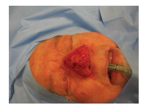
Figure 8: Case 3, intraoperative frontal post reduction.