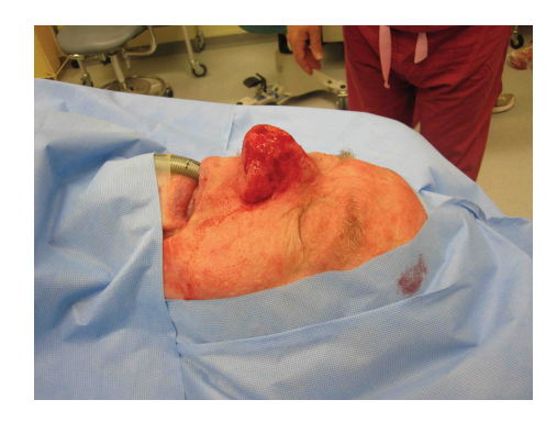
Figure 9: Case 3, intraoperative oblique post reduction Photos.