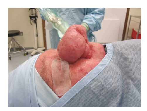
FIGURE 5: Case 3, intraoperative lateral.

of connective tissue, dermal fibrosis, and sebaceous gland hyperplasia are observed. Four variants of rhinophyma can be recognized: glandular, fibrous, fibroangiomatous, and actinic. In glandular form, the nose is enlarged mainly because of sebaceous gland hyperplasia. In the fibrous form diffuse hyperplasia of the connective exists. In the fibroangiomatous form fibrosis, telangiectasias, and inflammatory lesions are present. In the actinic form, nodular masses of elastic tissue distort the nose [4]. Although different histological subtypes do seem to occur, the diagnosis of rhinophyma is clinical. A biopsy can be useful where there is concern to rule out possible differentials such as lupus pernio, basal cell, squamous cell, sebaceous carcinomas, or nasal lymphoma [5]. A grading scheme has been suggested for rhinophyma: