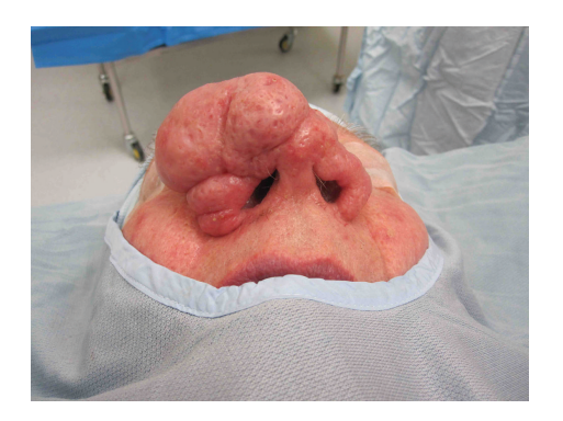
FIGURE 7: Case 3, intraoperative basal.