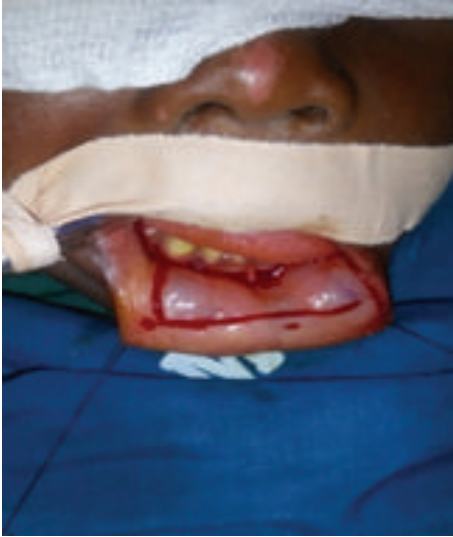
FIGURE 4: Oral mucosa graft being harvested from the lower lip.