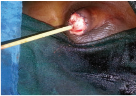
FIGURE 5: Oral mucosa used to graft the raw area of the corporeal bodies.